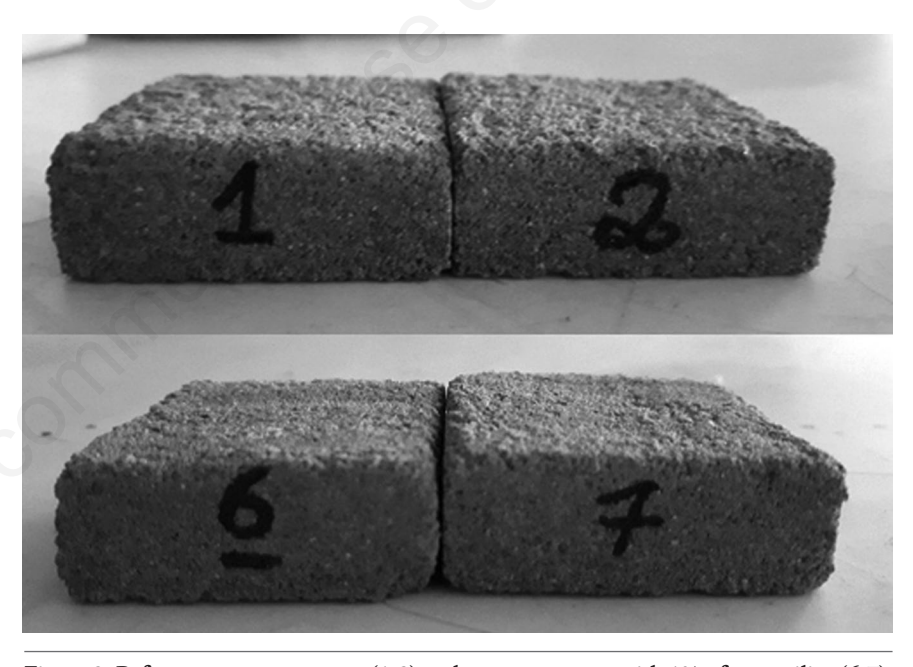
Figure 2. Reference cement mortars (1-2) and cement mortars with 1% of nano silica (6-7).

The presence of silica nanoparticles led to a decrease of thermal conductivity after curing at room temperature (Table 3), as expected according to the literature.<sup>8</sup> In the specimens with NS, the nanoparticles fill the pores, which means there is less avail-