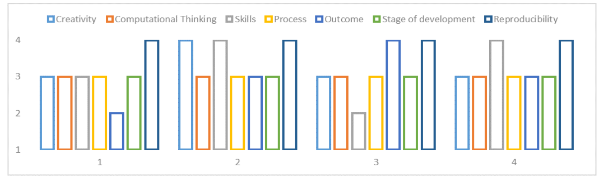
Figure 1. Case study result of four selected projects

After applying the proposed framework, Figure 1 shows the rating of the first four projects mentioned in the Appendix. This figure displays the rating of each dimension of a specific project, showing if a particular process is present in the project or not. If the process is present then it is evaluated according to the number of skills related to that process. If all the skills are identified, then the project will be rated '4' for that particular process or sub-dimension. If some skills in a certain dimension are missing, then the project will be rated accordingly. All these conditions are defined in the 'evaluation scale' column in tables 1 and 2. The results of the first four projects is displayed in Figure 1 to clearly exemplify the contribution of each sub-dimension. The evaluation results for all project is shown in Figure 2.