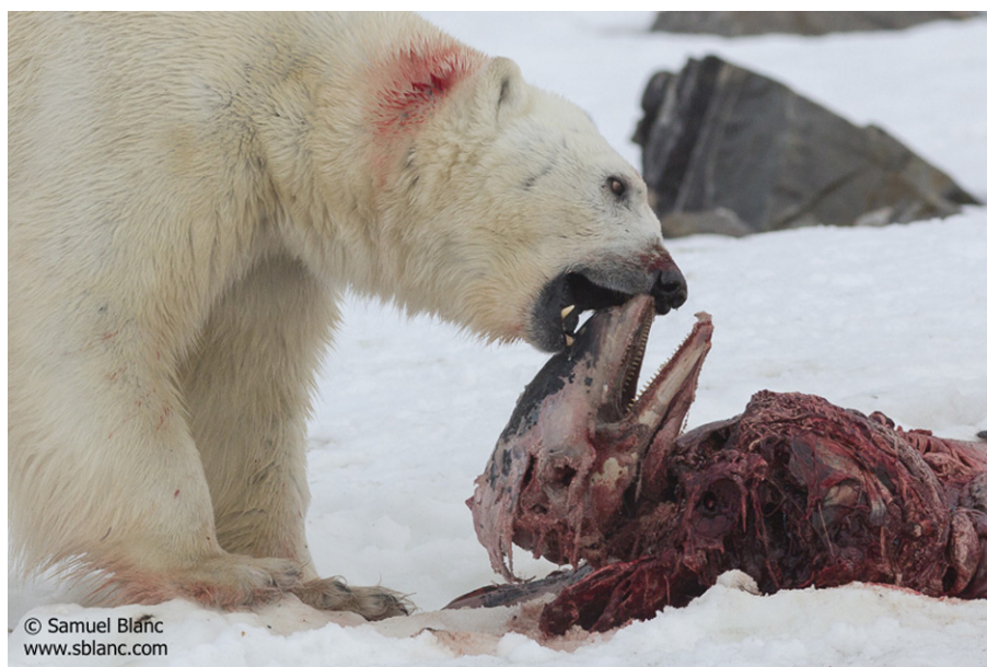
Fig. 3 An adult polar bear feeding on the remains of a white-beaked dolphin in Raudfjorden on 2 July 2014. The dolphin is presumed to be a member of the same pod as the dolphins eaten by a bear in April.

The observations indicate that entrapments of pods of white-beaked dolphins may provide a significant source of food for some bears locally over a longer period of time