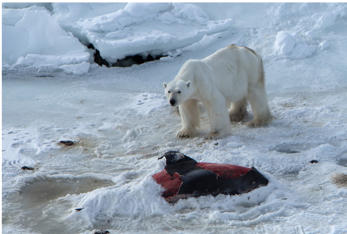
Fig. 1 A male polar bear on the carcass of a white-beaked dolphin, 23 April 2014. The bear has started to cover the remains with snow. Just to the left of the dolphin is a hole in the ice, assumed to be a breathing hole that dolphins trapped in the ice have kept open.

The polar bear was immobilized using a method described by Stirling et al. (1989) and an examination of its tooth wear yielded an estimated age of about 16–20 years. With clearly visible ribs, the bear was very skinny