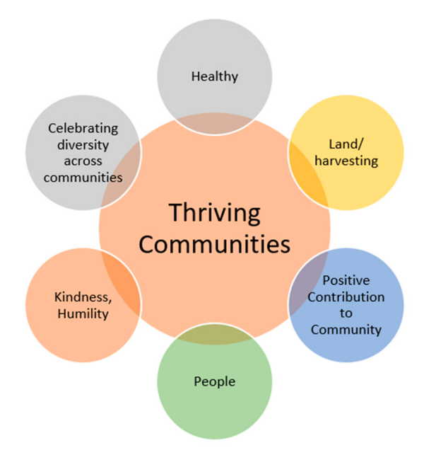
Figure 2. Elements of thriving Arctic communities.

"Thriving communities" emerged as an alternative framework for approaching holistic wellness in Arctic communities. Participants identified several aspects of thriving Arctic communities, which have been summarized by the authors as Figure 2, highlighting diversity, health, the land and harvesting, the positive contribution of individuals to the community, people, and kindness.