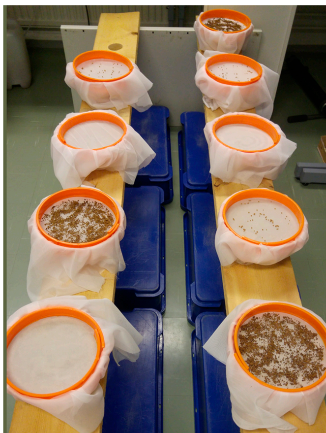
Figure A1. Cont.