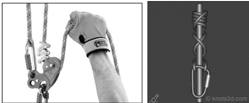
Figure 2. Zigzag descender (on the left) and Valdostain tresse (on the right).

The survey researched the use of relative innovative equipment, such as battery-powered electric chainsaws for pruning. Half of the respondents (42 of 84) and 5 of 6 arborists who have just started their career (less than one year of experience) declared using an electric chainsaw either often or always. Electric tools are widespread in all Italian areas, with a prevalence in the northwestern part of the country. Furthermore, what the perceived risk was in the use of this equipment was studied, asking whether the operator considered electric tools having higher, lower, or the same degree of danger in comparison with traditional chainsaws. Most of the respondents think that the two types of chainsaw are equally dangerous, while 19% consider electric tools less dangerous; 8% of the sample did not have a clear opinion.