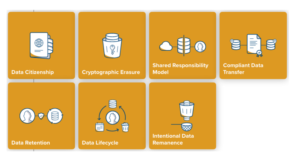
Figure 3. Official icons for compliance and regulatory pattern category. For other pattern categories, one can find them at [15].