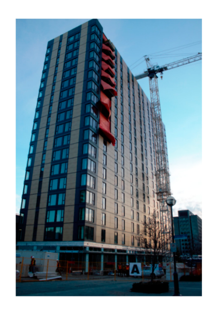
Figure 3. Tall hybrid timber building Brock Commons, Vancouver, Canada.

Although, timber has a good reputation in earthquake-prone regions, in the new era of timber skyscrapers, seismic actions and detailing require additional attention in design and construction of such structures. Tendency to build taller multi-residential and non-residential buildings with more occupants will require additional precautions. In the previous chapter it was pointed out what should change and how the design of such buildings should be done [18]. Holistic approach must be appointed to a design of such structures. Namely, in addition to conventional actions such as permanent loads, imposed loads, snow and wind, there are several additional actions which can significantly affect structural behavior of timber buildings, such as thermal actions, moisture, mold, fire, etc. Therefore, special attention has to be paid to detailing in tall timber buildings (architectural, structural and seismic detailing, special acoustics details, etc.). To prevent any potential structural damage in tall timber buildings due to aforementioned actions, continuous monitoring of buildings during their lifetime could be beneficial (installation of moisture sensors in critical places, vibration monitoring, etc.). Additional potential problems which should be addressed regarding the seismic provisions of tall timber structures are: