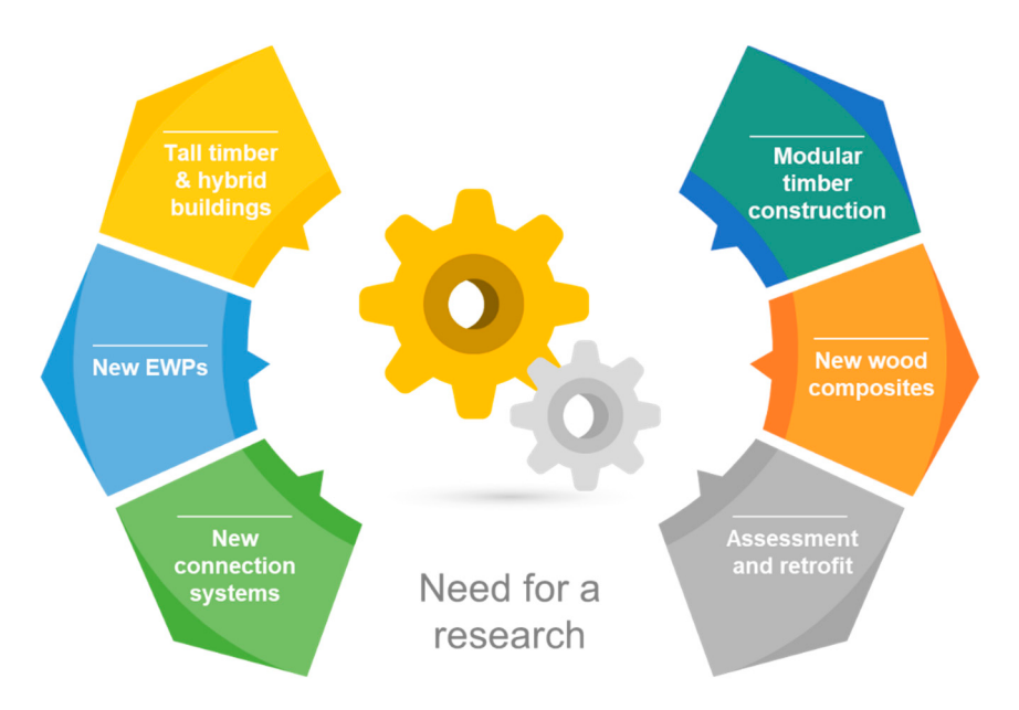
Figure 1. Future need for a research in timber engineering.

Future trends in timber construction will require major development and research on topics of: Tall timber and hybrid buildings, new engineered wood products and connection systems related to the new technologies, modular construction with timber, composites with wood, assessment of existing timber buildings and retrofitting of historical buildings with timber (Figure 1). Due to rapid development of new timber technologies, and especially due to taller and taller timber buildings, precisely defined impact of earthquakes on these structures needs to be investigated.