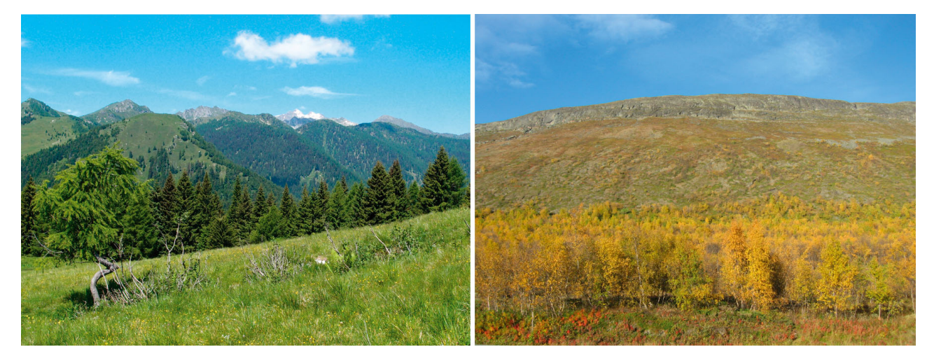
Fig. 2. Examples of treeline ecotones. Left southern Europe, right northern Europe

(1) Identifying main drivers of environmental change at different scales. Considering consequences for biodiversity, ecosystem functions and services, and sustainable resource use. Developing a scientific basis for best management practice in sensitive treeline ecosystems (i.e. mountain forests). Selected case studies on European high-altitude (Dinca et al. 2017, Fleischer et al. 2017, Holtmeier & Broll 2017) and on sub-polar ecosystems (Holtmeier & Broll 2017, Karlsen et al. 2017, Skre et al. 2017) were performed as part of this objective. In addition, Cudlín et al. (2017) and Wielgolaski et al. (2017) evaluated functions and processes of the treeline ecotones across Europe.