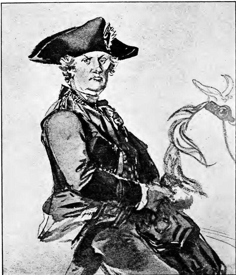
GENERAL COUNT DE ROCHAMBEAU.

After the painting by Trumbull, in the picture of "The Surrender of Yorktown." This portrait was posed for in 1787, in Paris, at the home of Jefferson, then Minister of the United States to France.