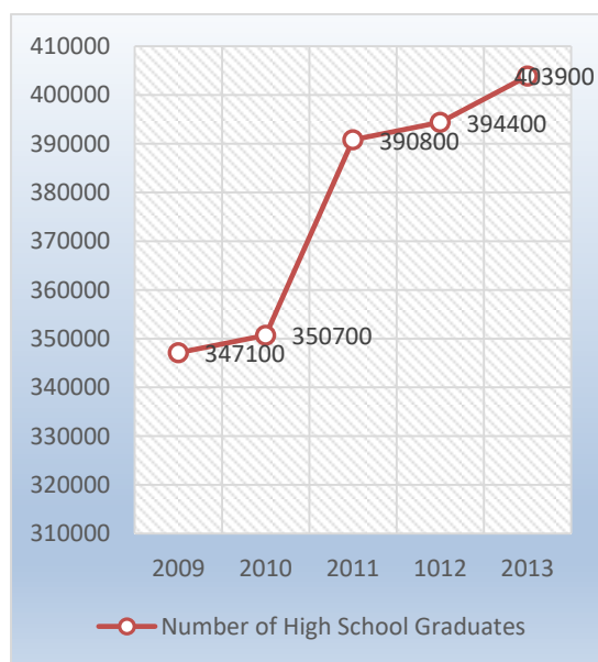
Figure 1. Number of high school graduates

By following the number of Number of High School Graduates during the period between 2009-2013 [14-15], one can see that there is a steadily marked increase showing a jump in the number of high school graduates from 347,100 in 2009 to 403,900 in 2013—a rise of 14%. It is expected that this increase will arrive at 460,446 if it flows at the same rate. This would require implementing a number of new policies that work to accommodate the increasing number of high school graduates.