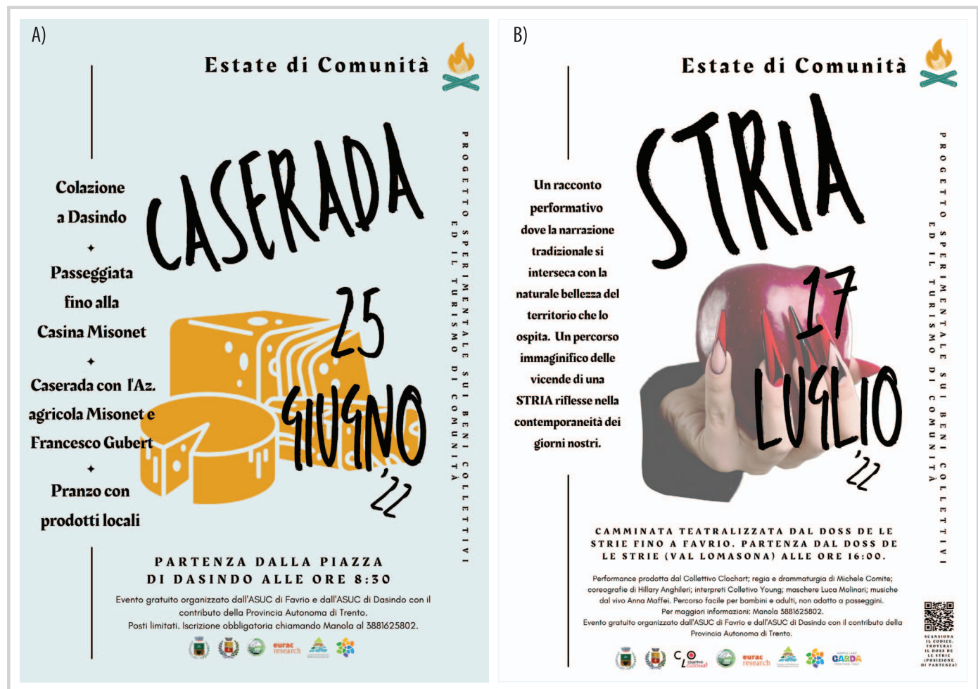
FIGURE 6 The first outputs of knowledge cocreation and intervention: advertising materials for the revitalization of collective resources through community-based tourism. (A) A poster advertising a collective cheese-making activity and lunch at the community hut. (B) A poster promoting a walking theater performance created by a theater collective with the participation of local communities and held in a space that symbolizes collective identity.

engagement of inhabitants toward care for the collective goods. Some conflicts (14) were identified in the interviews. These relate to increasing land fragmentation and different interests within the community (eg clearing rewilded spaces versus keeping specific tree species), and to different models of agricultural production (eg intensive and industrial versus extensive and based on short value chains). The intervention assessed in this study represents a step in reconfiguring the organizational model in terms of opening the decision-making process to increase awareness and empowerment of the communities toward collective resource care. The intervention created the conditions for the elected delegates to have a discussion with community members and external local stakeholders about the future of the commons and its contribution to local sustainable development.