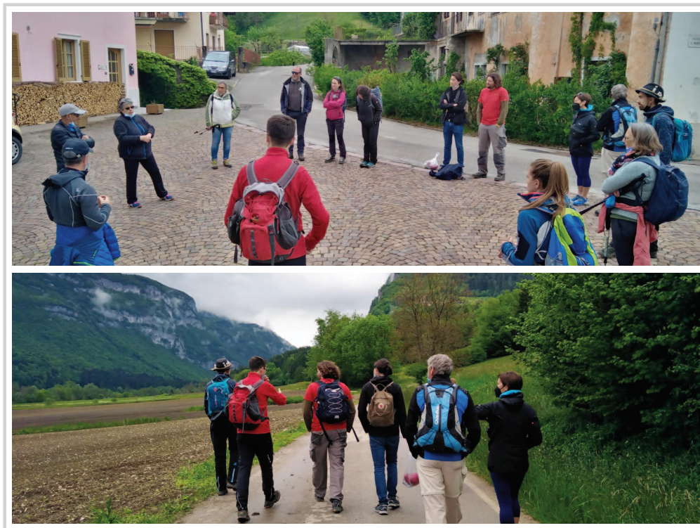
FIGURE 4 During the festival, convivial moments with the community and walks were functional to build relations with the communities and to explore collective resources and issues at stake.

Here, we briefly present the outputs of the different intervention phases and activities. The focus groups and surveys in each community were centered on identifying a variety of resources considered to be important for the community to take care of collectively; assessing how the values of these resources are changing; and envisioning their future and revitalization in the perspective of community development. Each focus group was carried out by dividing the participants into groups, each moderated by a core team member taking notes on a flipchart. Focus was placed on creating a group discussion to identify as many different resource values as possible, and to create a platform for communication among participants and discovery of these values and different interests. The reported resources and visions were interpreted according to the SESF categories (see Table S1, Supplemental material , https://doi.org/10.1659/mrd.2022.00013.1.S1 ). The resources identified in the focus