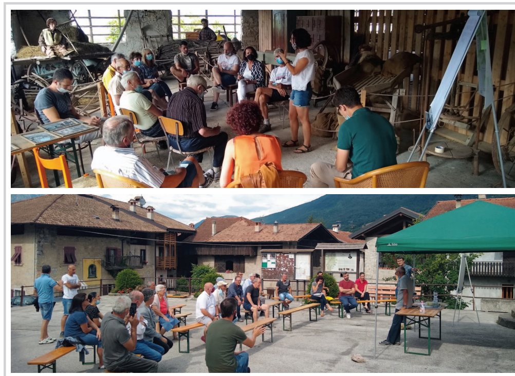
FIGURE 2 Intervention and research activities included focus group interviews in each community to identify collective resources, their changing values, and their future.

Note: CM, community members; ES, external local stakeholders.