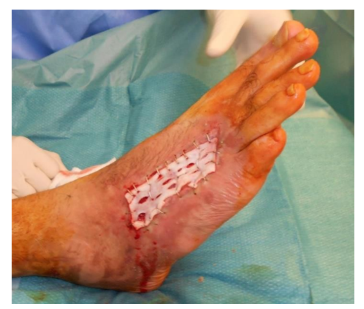
Figure 3. Patient underwent surgical procedure