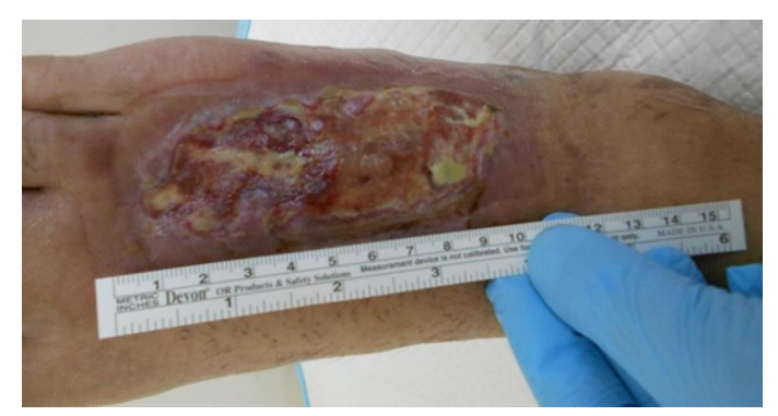
Figure 2. Open wound of the instep of the right foot