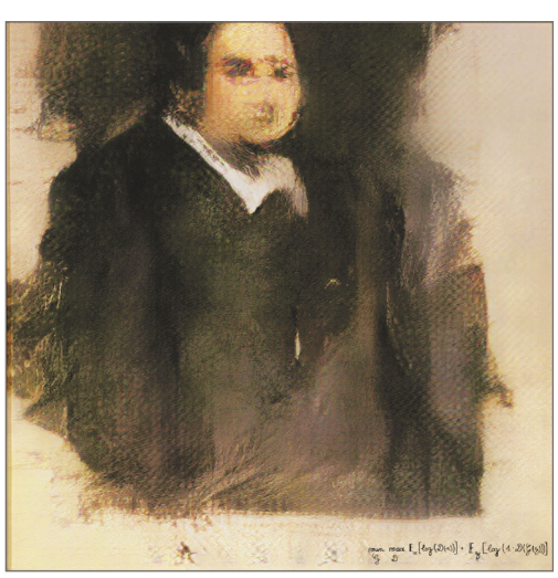
Edmond de Belamy painting. Download here (Public Domain): https://en.wikipedia.org/wiki/Edmond_de_Belamy#/media/ File:Edmond de Belamy.png

There is no doubt that in this case Computational Aesthetics help us improve understanding of human aesthetic perception. Because when intelligent machines start generating their own designs and art pieces, free from our aesthetic constraints, how are we as human beings going to be able to understand their own original outcomes? Are we ready to adapt and fall in love with non-antropocentric forms of creativity?