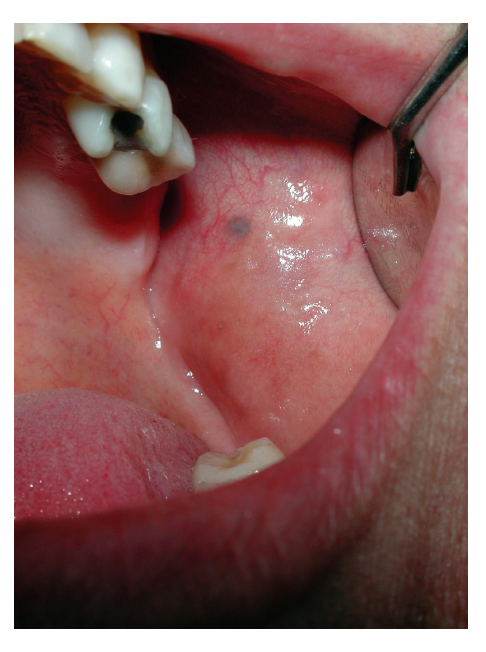
FIGURE 2: Clinical photographs of the 2 \times 2 mm pigmented lesion of the right buccal mucosa. Histopathological examination was consistent with amalgam tattoo in both lesions (see Figure 1).

However, studies are small and cannot provide certain stage-specific survival rates due to the rarity of the disease. Treatment is to a certain degree extrapolated from the regimens used for cutaneous melanoma [2, 9]. First choice treatment is wide radical excision. Though sentinel lymph node biopsy is state of the art for cutaneous melanoma, its role in mucosal melanomas remains uncertain and is not part