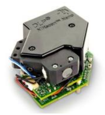
Figure 1. A Portable NIRS Device.

of the sample. Thus, detailed information about the inner configuration of the sample can be retrieved. The spectra of the resulting signal can be used for advanced analytics, allowing describing both physical and chemical parameters of the object being scanned. The technique is fast, accurate, non-destructive and requires little sample preparation. Traditionally, this technology has been reserved as an expensive laboratory instrument for trained personnel. Because of the extensive analytical capabilities of NIRS, researchers are working on developing portable solutions. An example is Texas Instrument's NIRS device, shown in Figure 1.