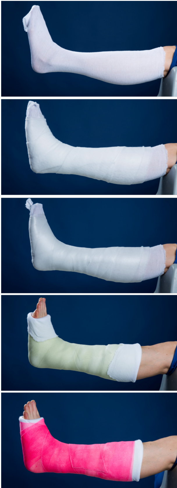
Figure 3 A standard, padded below the knee synthetic cast made by a trained plaster technician. Cast is applied from the tuberosity of the tibia to the base of the toes and is lined and padded. The cast is applied with the ankle joint placed at 90° angle (neutral dorsiflexion).

neutralization or antiglide 1/3 semitubular plate. The use of tourniquet was left at the discretion of the operating surgeon. All surgeries were performed during the office hours by experienced orthopedic trauma surgeons or by orthopedic residents under the direct supervision of an orthopedic trauma surgeon. Wounds were closed in two layers with the skin closed either using stitches or staples. Unless major swelling or wound bleeding, all operated ankles were placed on a below-the-knee cast identical to the non-operative group on the first post-operative day. The guidance on walking with crutches and the instructions on weight-bearing were identical to the non-operative group.