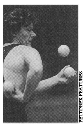
Pursuit of justice—keeping all the balls in the air

The four principles plus scope approach is clearly not without its critics. And the approach does not