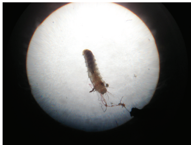
Figure 2 Photomicrograph of the cat flea larva (original magnification 10×).

Management of papular urticaria – prevention and eradication – is usually implemented without confirmatory evidence of