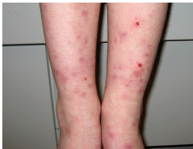
Figure 1 Clusters of excoriated erythematous papules and healing macules on the patient's lower extremities.