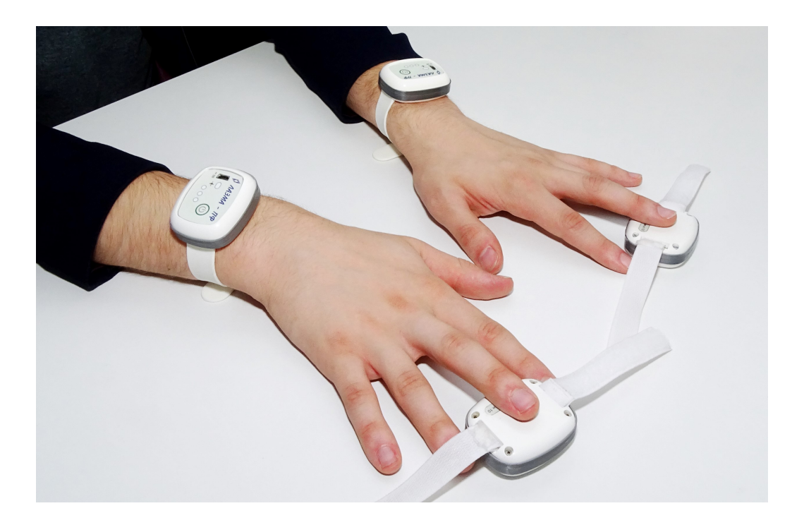
Figure 2. Location of the sensors

These areas were chosen because they represent two main skin types: glabrous and nonglabrous skin. Glabrous skin mainly covers the palms, soles and face. This skin type is primarily involved in body thermoregulation mechanisms. It contains a large number of arteriovenous anastomoses (AVAs) maintained in the constricted state by sympathetic tone. Thus, the sympathetic regulation is the dominant mechanism involved in the blood flow in the glabrous skin.<sup>18</sup> Nonglabrous or "hairy" skin covers almost the entire surface of the human body. It contains only a few AVAs, so that blood flow there is primarily nutritive in function. The reflex nervous regulation of this skin type involves both sympathetic noradrenergic vasoconstrictor nerves and separate sympathetic cholinergic vasodilator nerves.<sup>19</sup> The majority of studies devoted to age-related changes in microcirculatory blood flow was focused on the nonglabrous skin with less attention to glabrous skin sites.