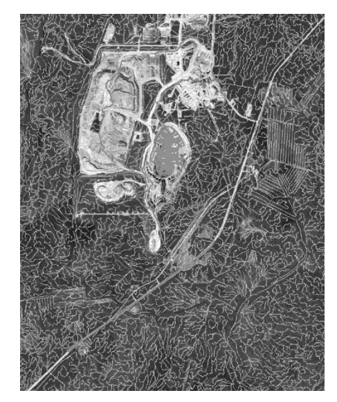
Figure 1: Watershed management. Main watersheds (red) with standard flowpaths (blue).

MMEA project introduced the digital surface model (DSM) of Agnico Eagle gold mine area in Kittilä, Finland. The Model was done using photogrammetric processing of airborne image data. DSM can be combined with watershed information for creating a model for watershed management presented in Figure 1. The aerial photography for DSM was done in the MMEA project using a small airplane, which is expensive, compared with modern applications using drones. Tong et al. [2] introduces technique for integrating uav-based photogrammetry with terrestrial laser scanning. They built three 3D models of open-pit mine areas. These new techniques can be used for creating more detailed models for watershed management.