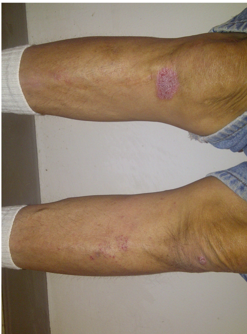
Figure 1. New-onset plaque psoriasis on the (a) lower abdomen at pegIFN- \alpha injection sites and (b) knees of a 57-year-old male with a one-year history of hepatitis C (HCV RNA 0 at presentation). Lesions appeared 4 weeks into pegIFN- \alpha treatment.