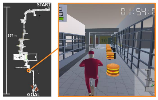
Fig. 1. The game area (left) and an actionshot from the game (right).

The university personnel frequently use kickboards for transferring along the hallways, which gave us the game topic. We adapted many of the head-up display options, minimap, player speed, leaderboard, time etc. from known racing games [7]. We added checkpoints inside the racetrack in key locations to improve the localization of the game scene, which also reflects the weather conditions on site. The game is built on top of Unity engine [8] using the free license version. The weather data is provided via Open Weather Map API [9].