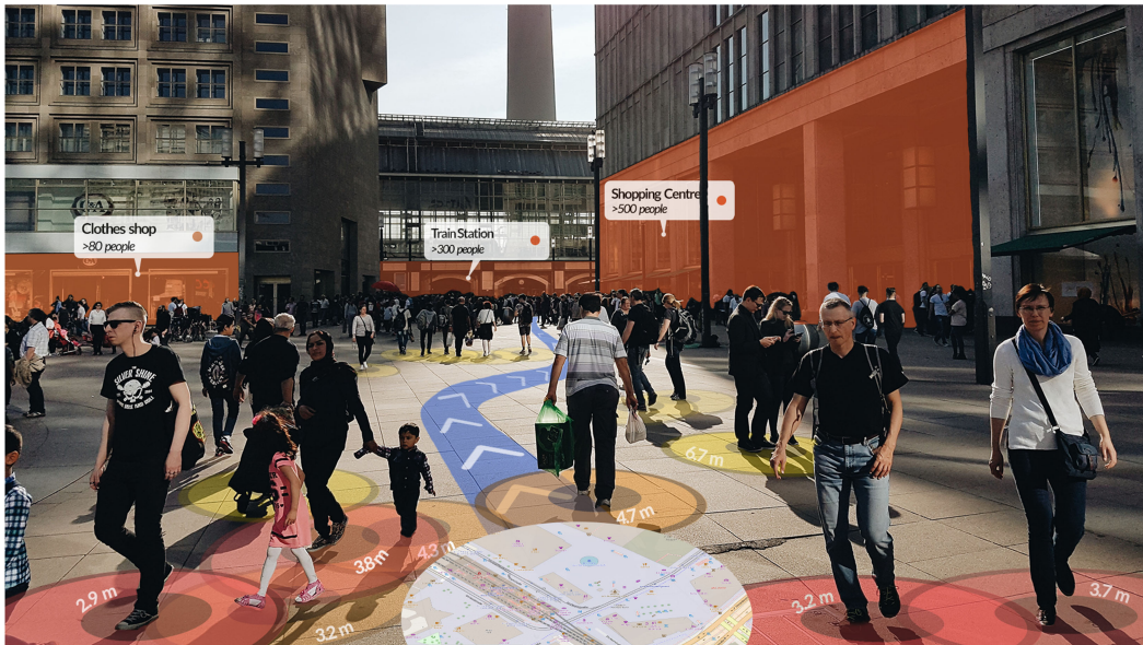
FIGURE 1. Vision of supporting social distancing during and after the COVID-19 global pandemic using AR and smart sensing technologies.

be stored and analyzed on a central server. Then, for visualizing this information in AR, buildings or rooms could be overlaid with a similar color coding scheme as the individual people risk assessment. Additional augmentations could contain general information, such as location names, estimated number of people, and other relevant contextual information.