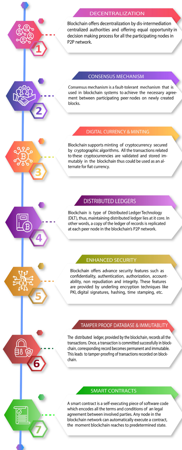
Figure 1. Key features of blockchain that can use to mitigate COVID-19 challenges.

A. Contact Tracing SARS-CoV-2 has an average incubation period from infection to symptoms of approximately 5.5 days, and it is estimated that a high percentage of cases are asymptomatic. Thus, it is vital to effectively and rapidly identify all social interactions that happened during this infectious incubation period