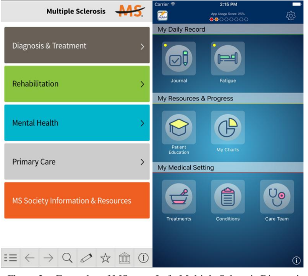
Figure 2. Examples of MS apps. Left: Multiple Sclerosis Diagnosis & Management. Right: MSAA - My MS Manager.

All MS apps found are shown in Table V as is their type of app and app store URL.