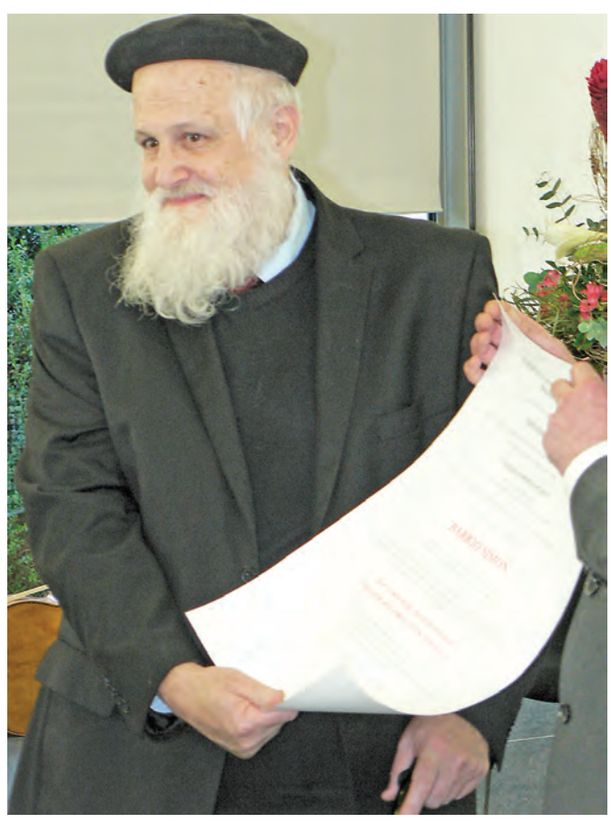
Honorary doctorate, Ludwig-Maximilians-University of Munich, 2014.