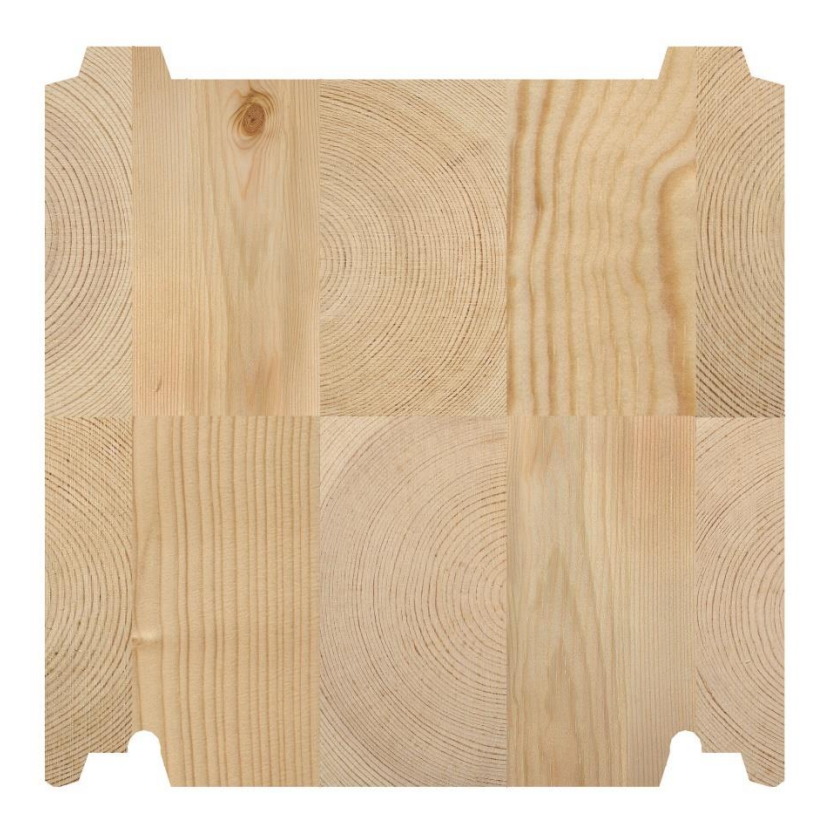
Figure 1. A cross-section of non-settling lamella log, dimensioned 275x275mm. [Kontio Log Houses]

To summarize, there is currently an ongoing, rapid development, where the utilization of log construction is increasing, and neither the use context of logs, nor the log itself are the same as in the past. Both the magnitude and the speed of this development create uncertainty in defining what the log itself is today, but also in defining what contemporary log architecture should be like; the perceptions mapped in this study will help in addressing these issues.