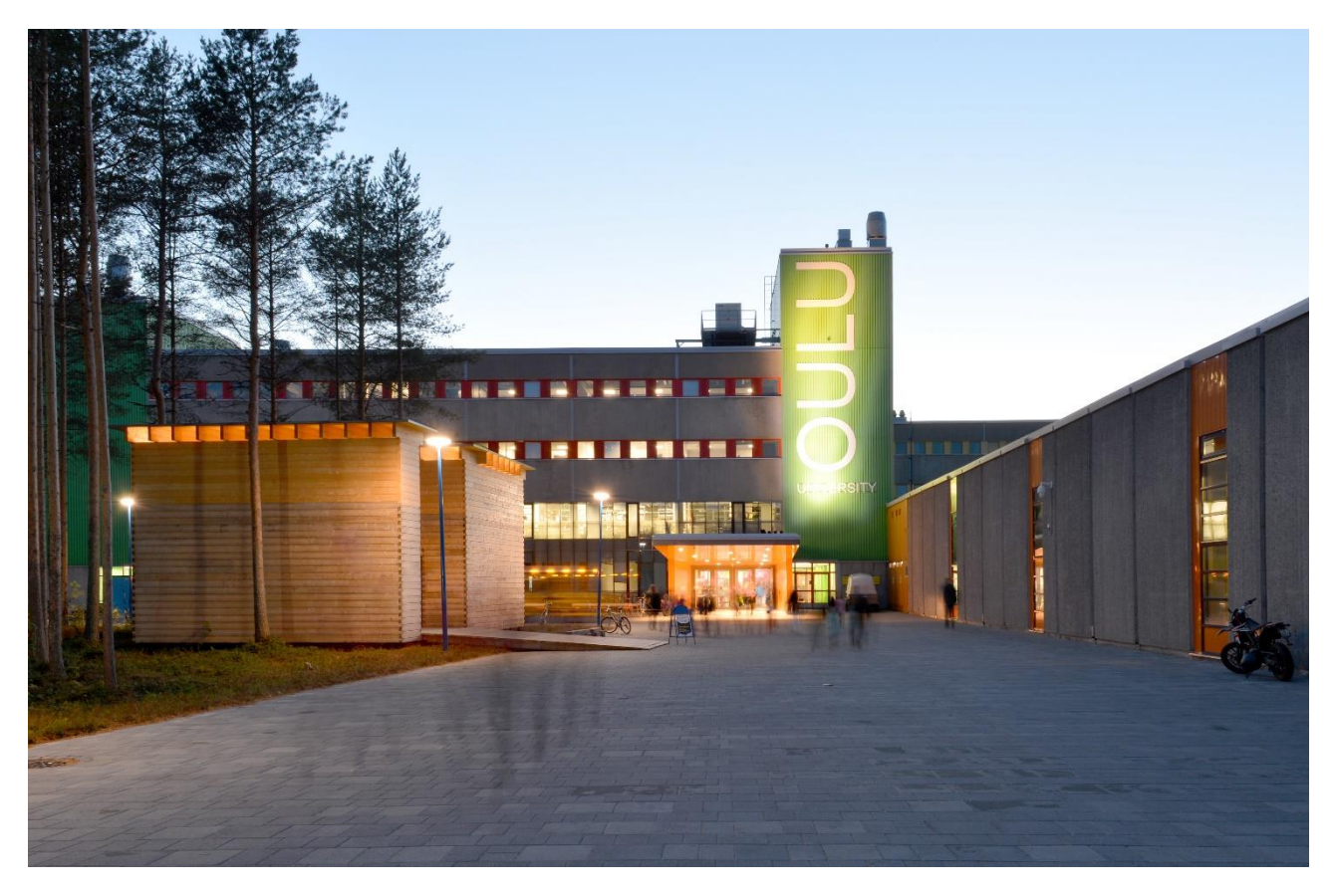
Figure 2. The second part of each interview was conducted at the Timber Tetris pilot pavilion, pictured on the right. [Matti Lakkala]