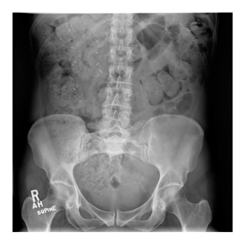
Figure 1. Abnormal colonic transit study with large amount of stool and retention of more than five radioopaque markers mostly in the right colon in a subject with constipation.