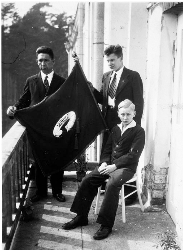
Fig. 10.3 The flag of the Humula hall at Halila Sanatorium.

that “the sanatorium was like one big family. Someone who hasn’t been there, in that society of people who have ended up on the dark side of life, cannot understand this.” 59 An elderly lady with several sanatorium stays behind her wrote that “the sanatorium has been a second home to which I have been able to return whenever the struggle to make a living has