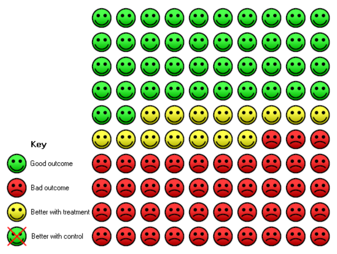
Figure 2. In the control group 58 people out of 100 had one or more exacerbations over 10 months, compared to 43 (95% CI 46 to 40) out of 100 for the active treatment group.