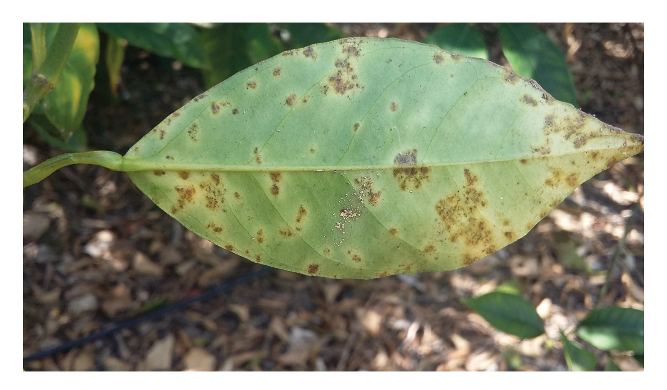
Figure 10. Symptoms of foliar greasy spot on the lower leaf surface of sweet orange.

The analysis of the fungal community using an amplicon metagenomic approach has revealed that Mycosphaerellaceae were the dominant group of fungi, in both symptomatic and asymptomatic leaves, and were represented by the genera Ramularia , Mycosphaerella and Septoria , with about 44, 2.5 and 1.7% of the total detected sequences [39]. The most abundant sequence type was associated to Ramularia brunnea , a species originally described to cause leaf spot in a plant of the family Asteraceae. Surprisingly, none of the detected sequences clustered with reference species currently reported as possible causal agents of greasy spot. Results are not conclusive and the aetiology of this emerging disease is still unresolved.