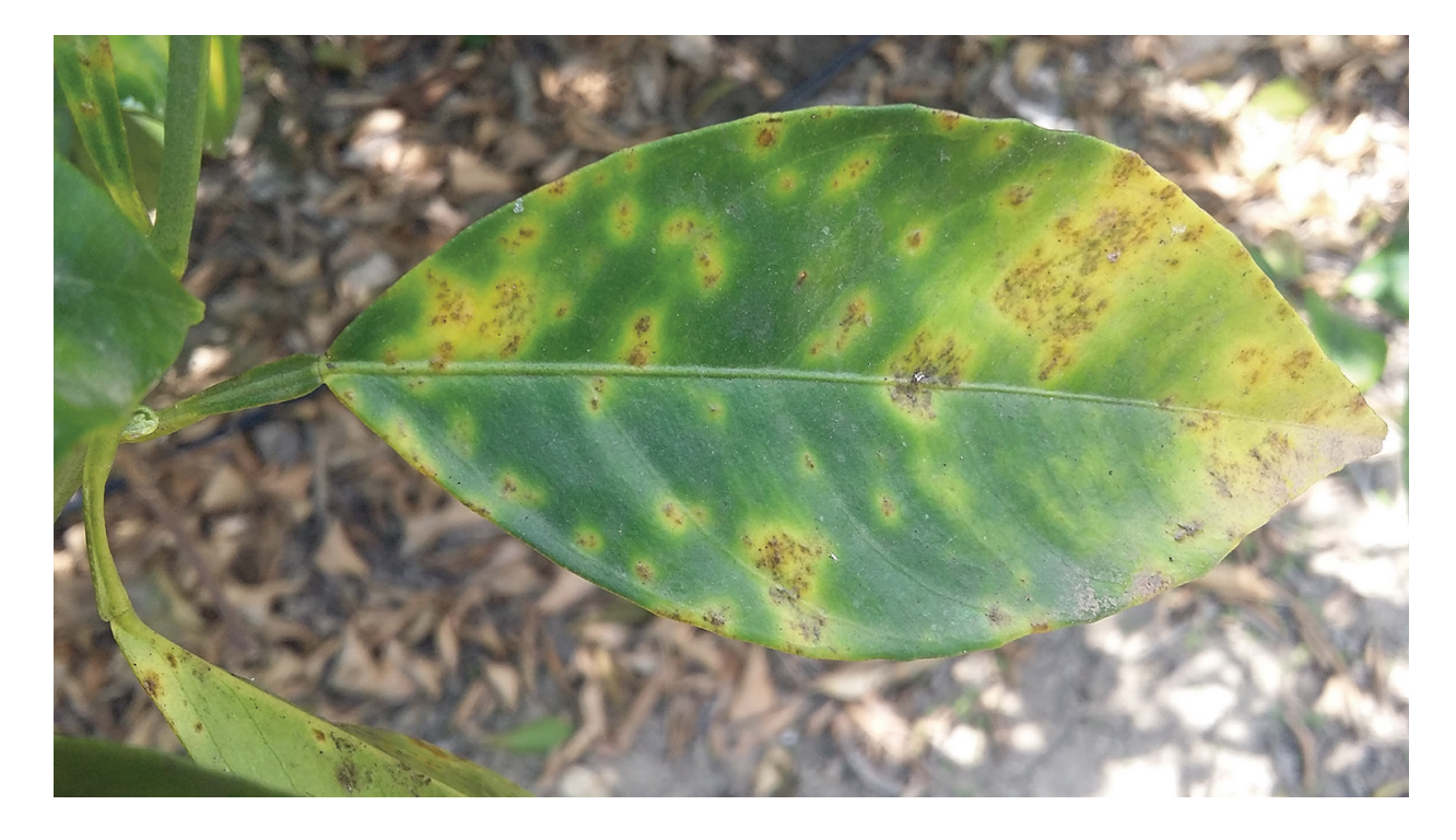
Figure 9. Symptoms of foliar greasy spot on the upper leaf surface of sweet orange.

During the last years, an epidemic outbreak of a foliar disease closely resembling greasy spot has been observed in some citrus-growing areas of western Sicily (Italy). Symptoms appear on mature leaves and range from those typical of greasy spot ( Figures 9 and 10 ) to black dots. Premature leaf drop occurs and causes heavy defoliation of the tree.