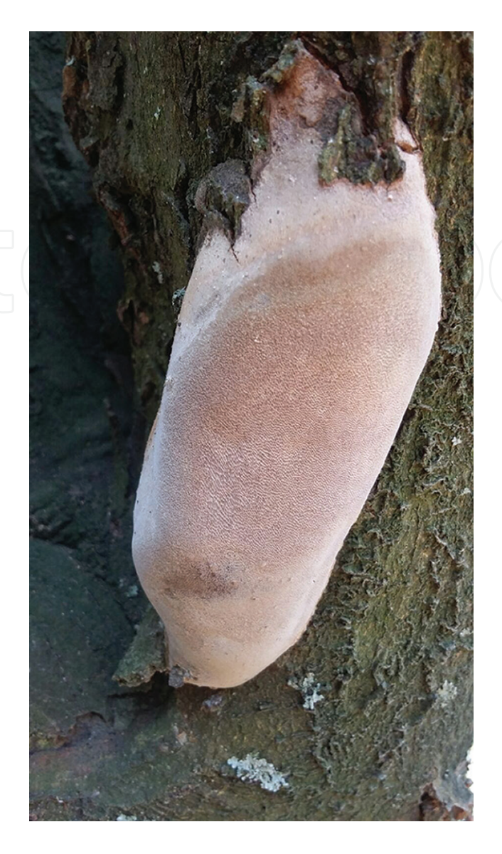
Figure 12. Basidiocarp of Fomitiporia mediterranea (courtesy S.O. Cacciola and A. Pane).

genotypes. This and the high frequency of basidiomata in old commercial orchards confirm the outcrossing nature of reproduction in F. mediterranea and the primary role of basidiospores in the dissemination of inoculum. Prevention is the only way to manage wood rots. Trees should be kept healthy and vigorous. Large pruning cuts, or other wood-exposing injuries, should be avoided, especially during wet periods. Proper management guidelines include sanitation of pruning cuts with mastics to prevent the penetration of the pathogen.