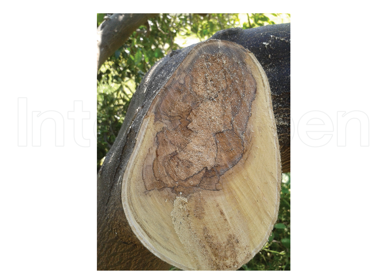
Figure 11. Symptoms of wood rot caused by Fomitiporia mediterranea on Citrus sp. (courtesy S.O. Cacciola and A. Pane).

F. mediterranea is a ubiquitous and polyphagus species, commonly found also on other fruit, ornamental and forest tree species, such as hazelnut, olive, kiwi, locust tree and privet. On grape, it is associated to 'Esca' disease. It is assumed that most infections in citrus orchards originate from airborne basidiospores germinating on large pruning wounds of trunk and main branches. Basidiospores produced by basidiomata germinate with relative humidity over 90% and are dispersed by wind. Usually, basidiomata ( Figure 11 ) emerge from the bark after the wood of trunk or branches has been extensively colonized by the fungus ( Figure 12 ). In Southern Italy, the analysis of F. mediterranea internal transcribed spacer (ITS) sequences revealed a high level of genetic variability, with both homozygous and heterozygous