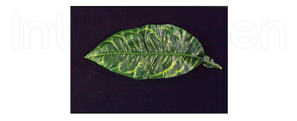
Figure 3. Clearing and chlorosis of a sour orange leaf affected by Plenodomus tracheiphilus.