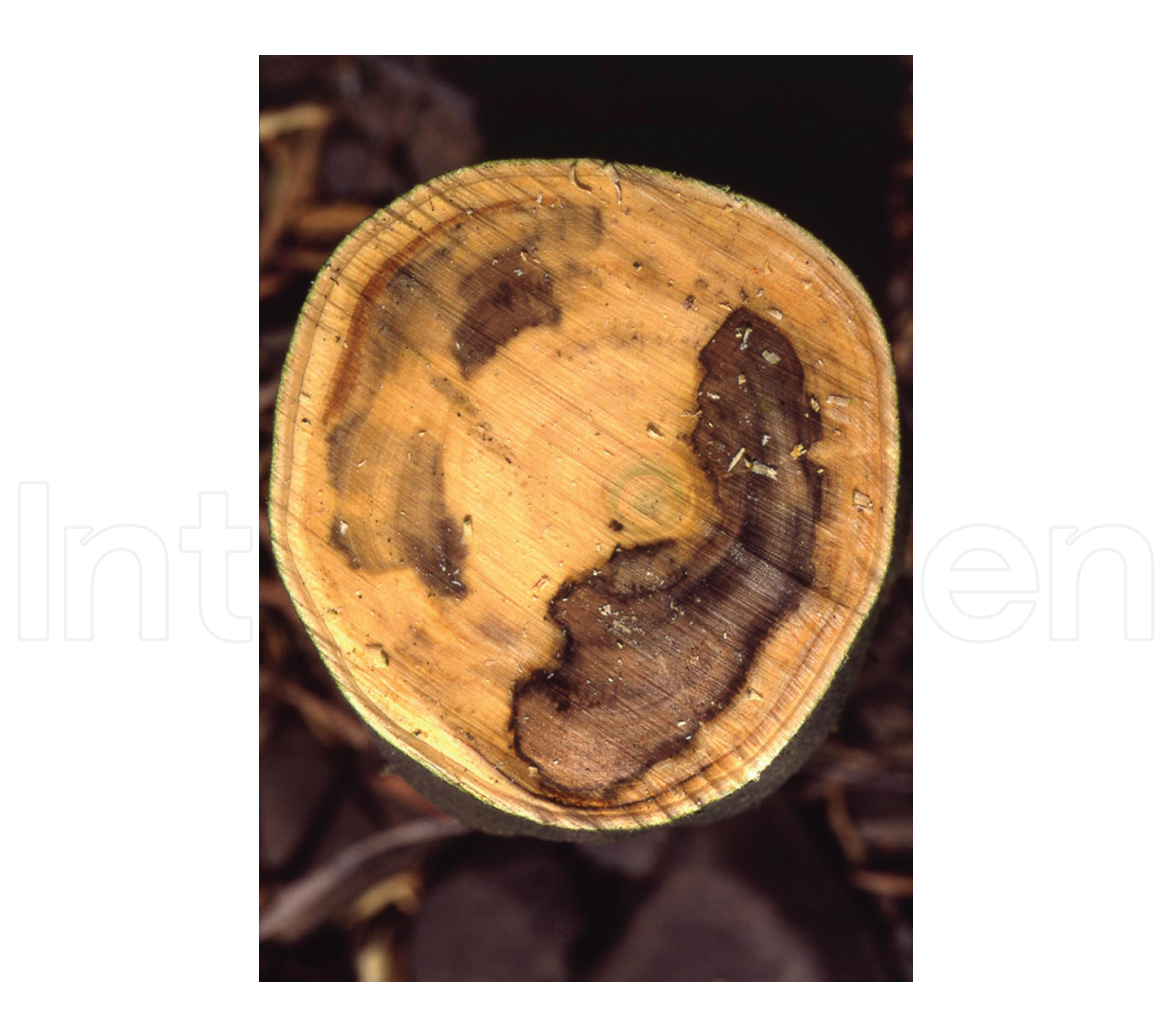
Figure 4. The 'mal nero' facies of mal secco disease.