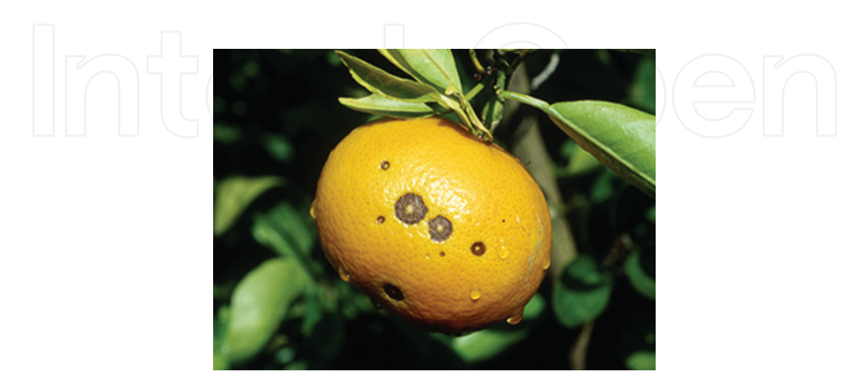
Figure 6. Typical symptoms of Alternaria brown spot on 'Fortune' mandarin.

areas and semi-arid regions provided a susceptible citrus variety is present. Fruits can get infected in all development stages but are more susceptible during the first four months following petal fall. Spring infections on young fruits may lead to premature fruit drop. Early fruit drop is common, especially if infection has occurred shortly after petal fall. Symptoms on fruits are necrotic brown circular lesions that may vary in size (Figures 6 and 7). Mature