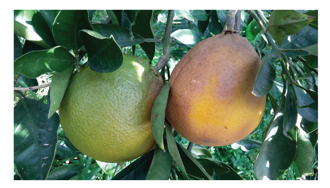
Figure 14. Sweet orange fruit with symptoms of brown rot caused by Phytophthora citrophthora.

gummosis. Other species found occasionally include Phytophthora citricola , Phytophthora cactorum , Phytophthora hibernalis and Phytophthora syringae . The last two species are found during winter months solely because of their low-temperature requirements.