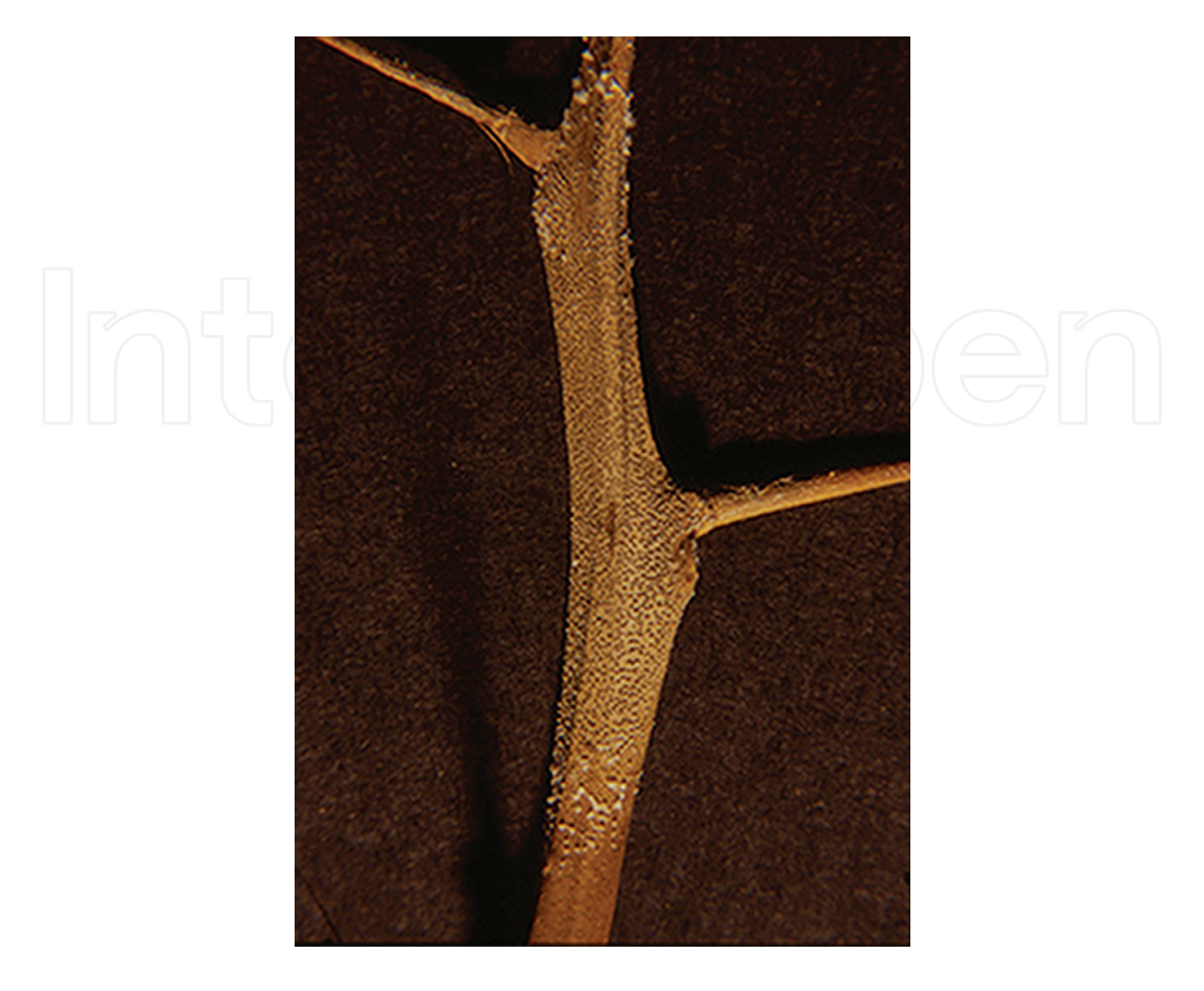
Figure 5. White-red 1–2-year-old twig of lemon with pycnidia of Plenodomus tracheiphilus . Pycnidia appear as scattered black spots on the dried portion of the twig.

While in Sicily most infections occur from autumn to early spring; in Israel, mid-November to mid-April was the most conducive time for infection, coinciding with the rainy season, although no correlation was found between the amount of rain, the number of rainy days and the percentage of infected plants. No infection was observed after the rain ceased, so it appears that the rain affects inoculum dissemination rather than infection [20]. Length of the incubation period varies according to season, and in young trees, it ranges between 2 and 7 months, whereas it can last several years in the "mal nero" form of the disease because this chronic infection could remain confined to the heartwood over a long time. Expression of symptoms is therefore a poor selection criterion for phytosanitary inspection of propagation material. This aspect has practical relevance as the use of disease-free propagation material helps to reduce the dissemination of mal secco and its introduction into disease-free areas.