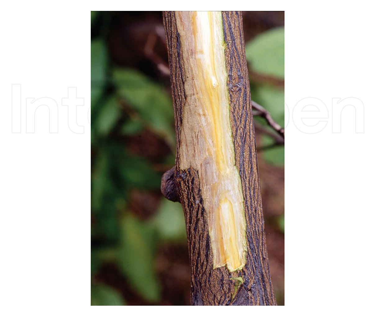
Figure 2. Pink-salmon discoloration of the wood associated to mal secco disease.