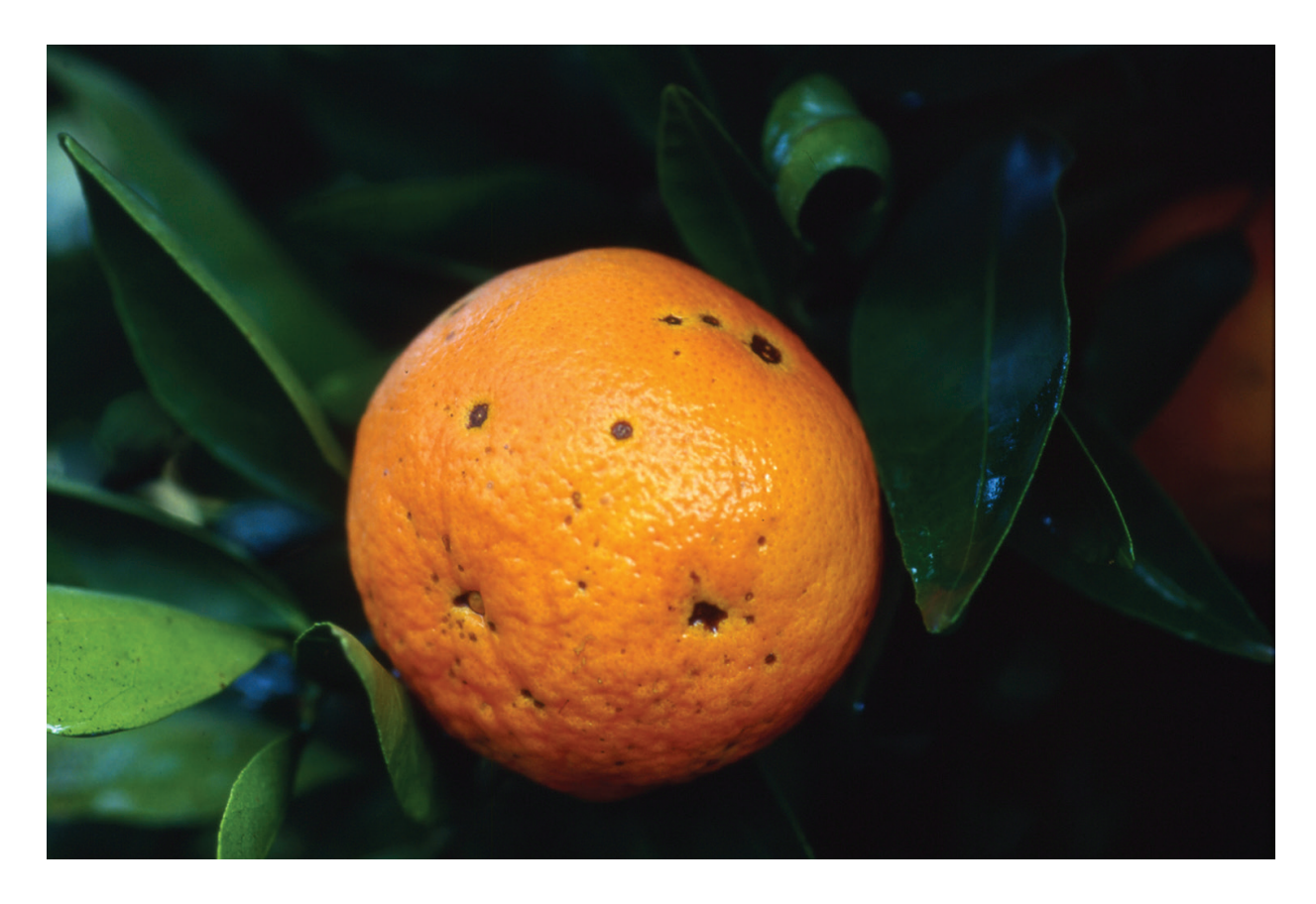
Figure 7. Alternaria brown spot on 'Nova' tangelo hybrid.