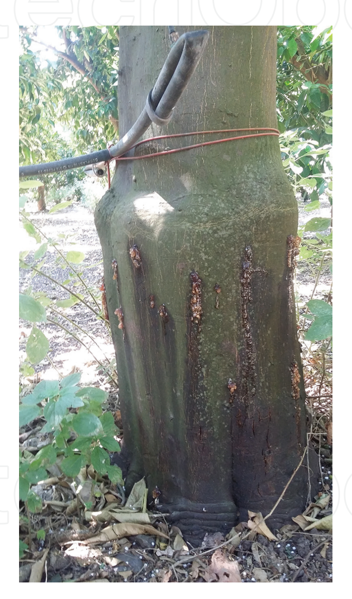
Figure 13. Trunk gummosis caused by Phytophthora citrophthora on a citrus tree.

parts of the tree, including roots, stem, branches, twigs, leaves and fruits. There are several forms (facies) of Phytophthora diseases including root rot, foot rot (Figure 13) (also known as Phytophthora gummosis, trunk gummosis or collar rot), fruit brown rot (Figure 14), twig and leaf dieback (often indicated collectively as canopy blight) and rot of seedlings (better known as damping off of seedlings). Trunk gummosis and root rot are the most serious facies of this group of diseases, and after the pandemic outbreak of the nineteenth century and the consequent widespread use of resistant rootstocks, they are regarded as endemic diseases in all citrus-growing areas of the world.