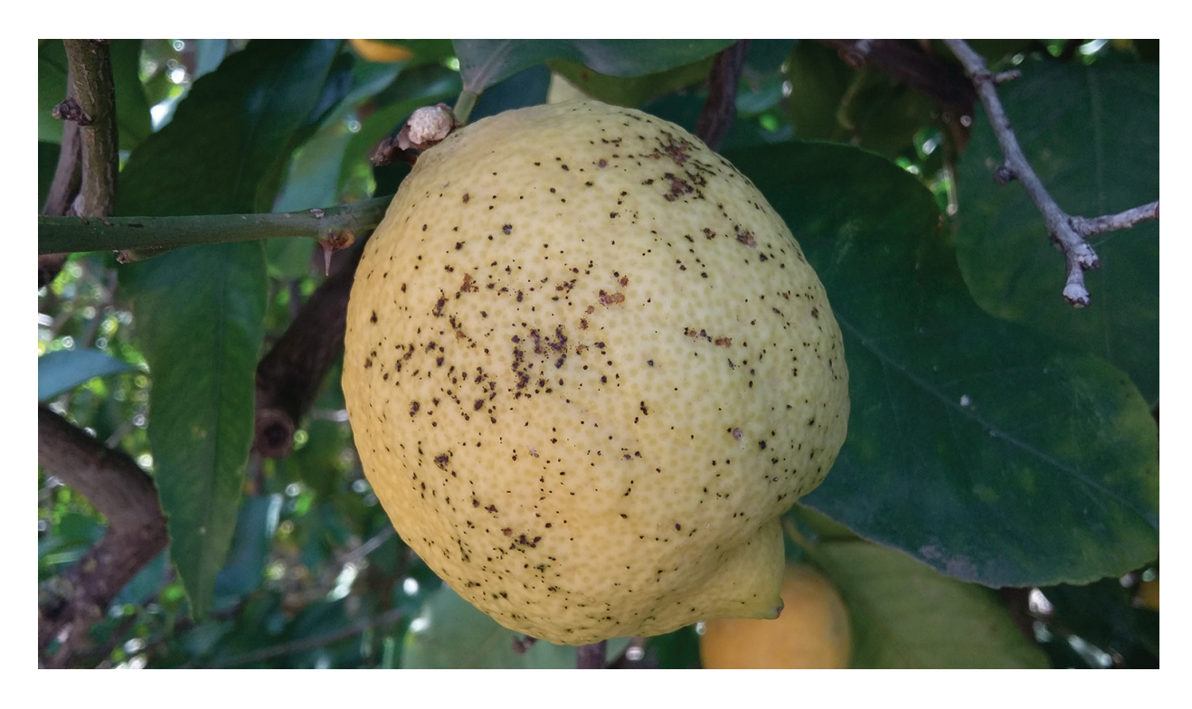
Figure 8. Typical symptoms of Septoria spot on a lemon fruit.

cool, frosty or cold windy weather. The susceptibility of fruits is related to the maturity of the rind at the time of infection. Management practices to prevent or reduce the disease incidence and severity include tree skirting and canopy pruning to improve air circulation, early fruit harvesting and the removal of withered twigs from the tree canopy and fallen leaves from the soil under the tree canopy to reduce the amount of inoculum. Copper sprays in late fall or early winter to control fruit brown rot caused by Phytophthora citrophthora are also effective against Septoria spot.