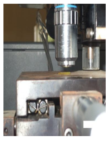
Figure 4 Specimen placed on the Vickers micro hardness tester

The Vickers micro hardness H V is calculated by using formula