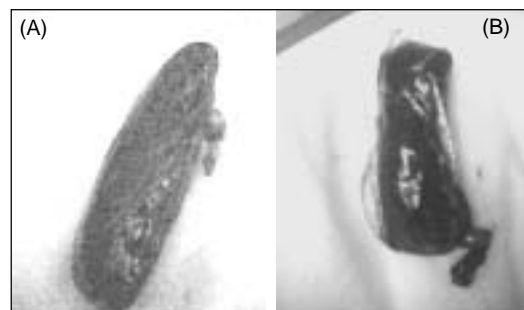
Figure 2: (A) This packet removed from the stomach. (B) This packet removed from the rectum

Constipating agents, such as diphenoxylate or loperamide, are frequently used. [1] Transit times may be as brief as one or two days or as long as two to three weeks. After entering the country of destination, body packers use laxatives, cathartics, or enemas to help pass their cargo rectally. [2]