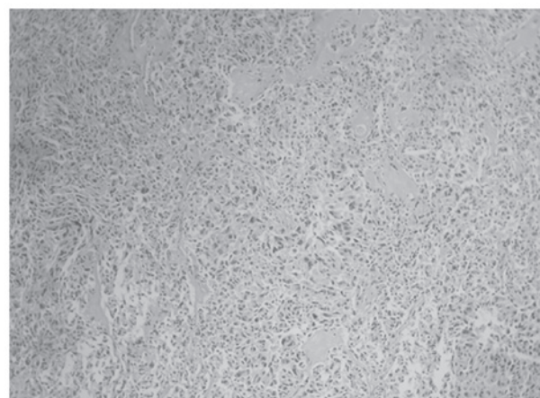
Figure 4. Histology of the resected specimen. H&E; magnification, x100.

according to Boedeker et al (5) the term paraganglioma should only be used for tumors of neural crest origin that develop in the head and neck. Although no definite classification of paragangliomas has been made, paragangliomas can be classified as being either 'functional' or 'non-functional', with 15-24% being functional, and also by the presence of accompanying clinical symptoms, including hypertension, hyperhidrosis and hyperglycemia, which are characterized by the secretion of catecholamines (6). The clinical symptoms vary according to the amount of catecholamines released. Observable clinical effects are only obtained if the tumor secretes a sufficient quantity of catecholamines. However, circulating catecholamine levels do not have a strong correlation with the degree of hypertension in paraganglioma. It is considered that 30% of functional paraganglioma patients have normal blood pressure (7). The possible reasons for this have been explained by Agarwal et al (8). In our study, the patient had normal blood pressure and did not receive a metanephrine examination, with a diagnosis of retroperitoneal tumor. However, the blood pressure rose intraoperatively upon touch and mobilization of the tumor. Once the tumor was removed, the patient's blood pressure fell. Histopathology revealed a paraganglioma.