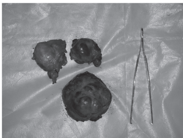
Figure 2. The excised tumor.