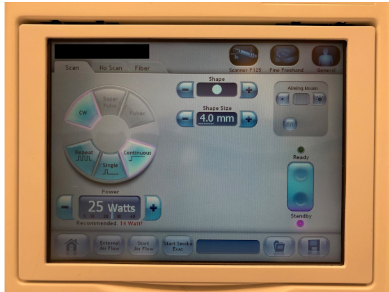
Figure 1: Photo of laser settings. Standard laser settings for CO2LT on the laser system used. Please click here to view a larger version of this figure.

group, 97.2% of patients were cured after initial treatment. The overall satisfaction rate was similar in both treatment groups, but the mean pain intensity scores two weeks post-operatively were 5.4 (out of 10, range 0-9) after tonsillotomy and 7.7 (out of 10, range 2-10) after tonsillectomy leading to longer (9.9 vs. 5.4) use and use of stronger pain medication (NSAIDs / opioids versus acetaminophen) after tonsillectomy. Days to full recovery and number of post-operative bleeding events were both significantly higher in the tonsillectomy group ( Figure 2 ).