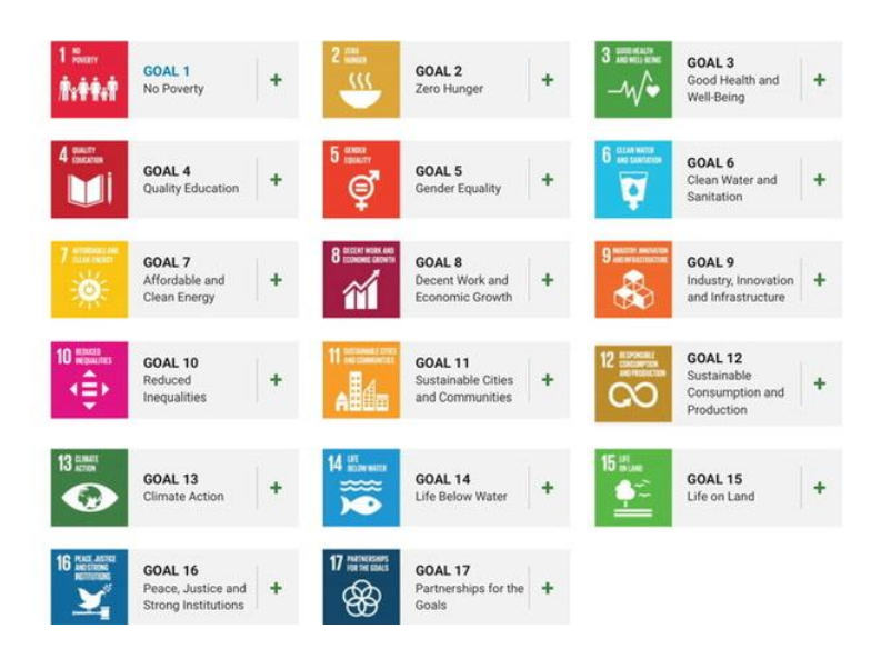
Figure 3. A summary of sustainable development goals in Agenda 2030 (source: Italian National System for Environmental Protection, SNPA).

Unlike the MDGs, the prefixed objectives of Agenda 2030 did not distinguish between developed and developing countries, since they affect all states without distinction, and this strategy appears to be an implicit contribution to the spatially balanced development theme of the sustainability paradigm. The holistic vision of Agenda 2030, encompassing intrinsically different ecological and socioeconomic dimensions, provides the appropriate rationale to address sustainable development under complex system conditions. Land degradation issues are intimately related with most of the Agenda 2030 dimensions. In these regards, the sustainable development goals indirectly paved the way for a more holistic and integrated evaluation of land degradation, outlining the need to reconnect local contexts with the ensemble of processes leading to landscape change and socioeconomic transformations.