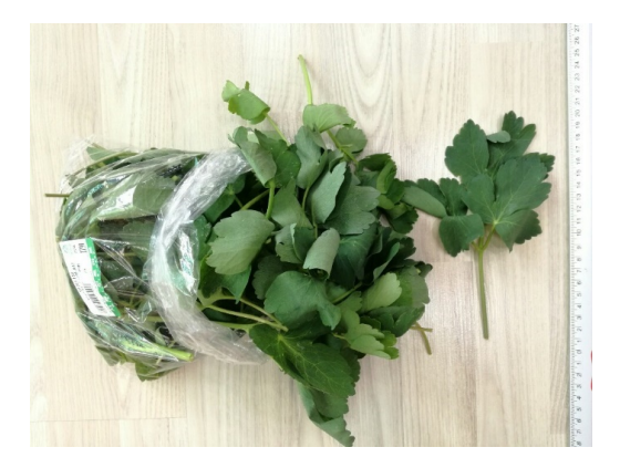
Figure 3. Peucedanum japonicum.

Peucedanum japonicum is traditionally had been foraged from the wild. However, the plant is now cultivated in South Korea for its health benefits (Figure 3). The leaves contain a fragrant aroma, a little bitter and sweet taste. This leafy vegetable can be eaten raw as a salad, blanched, pickled or deep-fried. Peucedanum japonicum can be cultivated in an open field, greenhouse or hydroponic cultivation system [85,86].