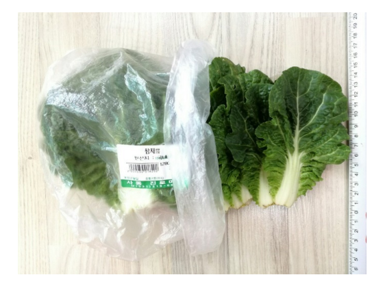
Figure 2. Ssamchoo (Brassica lee ssp. namai cv. Ssamchoo).

Ssamchoo has a smaller leaf size (Figure 2) than those of Chinese cabbage and regular cabbage [76]. Red Ssamchoo draws attention due to its red leaf and stem color [76]. Ssamchoo brings together the slight bitterness from Chinese cabbage and nutty sweetness from regular cabbage [76]. This leafy vegetable is lightly aromatic, sweet, juicy, mini-sized, and can be used in salads and soups and may be deep-fried [76].