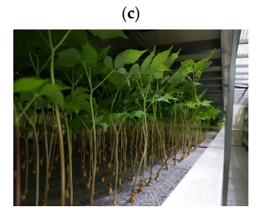
(d) Figure 5. Cont.