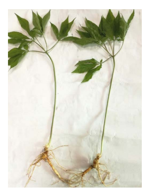
Figure 1. Mountain-cultivated Korean ginseng (Panax ginseng Meyer).

and should be grown for about 5–6 years before harvest [70]. Because of this length of time, it is a high-priced product for consumers (Figure 1). In contrast, Korean ginseng sprout uses all parts of the plant, not only roots, but especially the leaves due to their young tender texture. Leaves contain higher levels of certain types of ginsenosides (Rg1, Rg2+Rh1, Rd, and Rg3) than roots [71]. It can be grown in a hydroponic cultivation system either without soil [72,73] or with nursery soil [59,74] Therefore, ginseng sprouts can be produced all year round without using pesticides in appropriate conditions. It only needs to be grown for 2–8 weeks after transplanting of one-year-old-ginseng-seedlings [59,72].