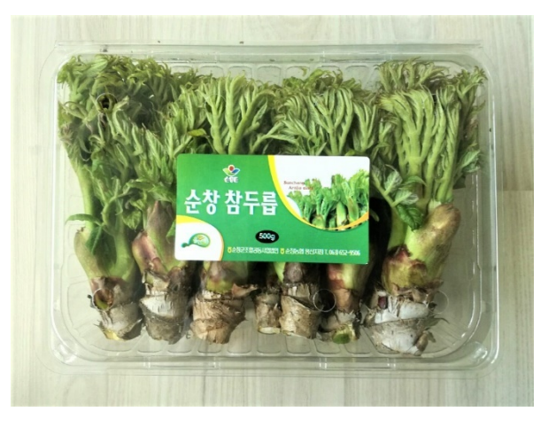
Figure 4. Aralia elata (Miq.) Seem.

The young shoots of Aralia elata (Miq.) Seem. have been generally foraged from the wild, but it is cultivated in Japan and South Korea for its expected health benefits (Figure 4). This young shoot has a mildly bitter and sweet taste, fragrant aroma, and a crunchy texture. This shoot vegetable is enough to be an ornament itself in dishes, and thus this young shoot is used as a garnish in Japanese cuisine [93]. In South Korea, the shoots are simply blanched and consumed with a spicy-sour sauce. This aromatic vegetable can also be pickled and deep-fried.