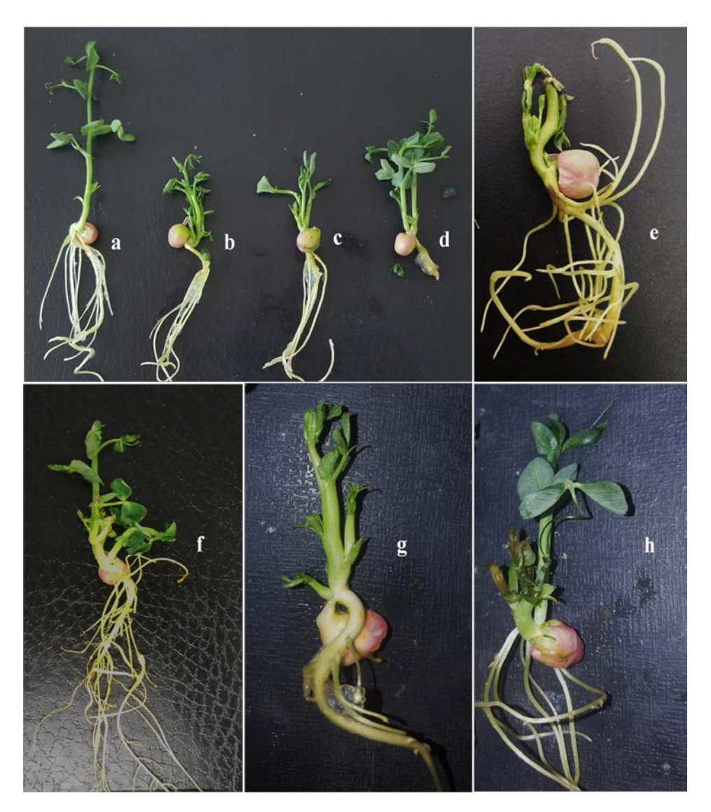
Figure 2. Phenotype of pea seedlings inoculated with pistachio and almond Rhodococcus strains 14 days post inoculation (dpi). ( a ) Negative control inoculated with Yeast Extract Broth. ( b ) and ( c ) Multiple shoots at cotyledon node of pea seedlings inoculated with Rhodococcus almond strains BA3 and BA2, respectively. ( d ) Multiple shoots and inhibited root growth of pea seedlings inoculated with Rhodococcus almond strain SA3 and BA2, respectively. ( d ) Multiple shoots and inhibited root growth of pea seedlings inoculated with Rhodococcus almond strain SB10. ( g ) Swollen stem and reduced shoot and root growth of inoculated pea seedlings with Rhodococcus pistachio strain Mt9. ( h ) Hypertrophied shoots of pea seedlings inoculated with Rhodococcus pistachio strain Mt9. ( h ) Hypertrophied shoots of pea seedlings inoculated with Rhodococcus pistachio strain Mt9. ( h ) Hypertrophied shoots of pea seedlings inoculated with Rhodococcus pistachio strain Mt9. ( b ) Hypertrophied shoots of pea seedlings inoculated with Rhodococcus pistachio strain Mt9. ( b ) Hypertrophied shoots of pea seedlings inoculated with Rhodococcus pistachio strain Mt9. ( b ) Hypertrophied shoots of pea seedlings inoculated with Rhodococcus pistachio strain Mt9. ( b ) Hypertrophied shoots of pea seedlings inoculated with Rhodococcus pistachio strain Mt9. ( b ) Hypertrophied shoots of pea seedlings inoculated with Rhodococcus pistachio strain Mt9. ( b ) Hypertrophied shoots of pea seedlings inoculated with Rhodococcus pistachio strain Mt9.