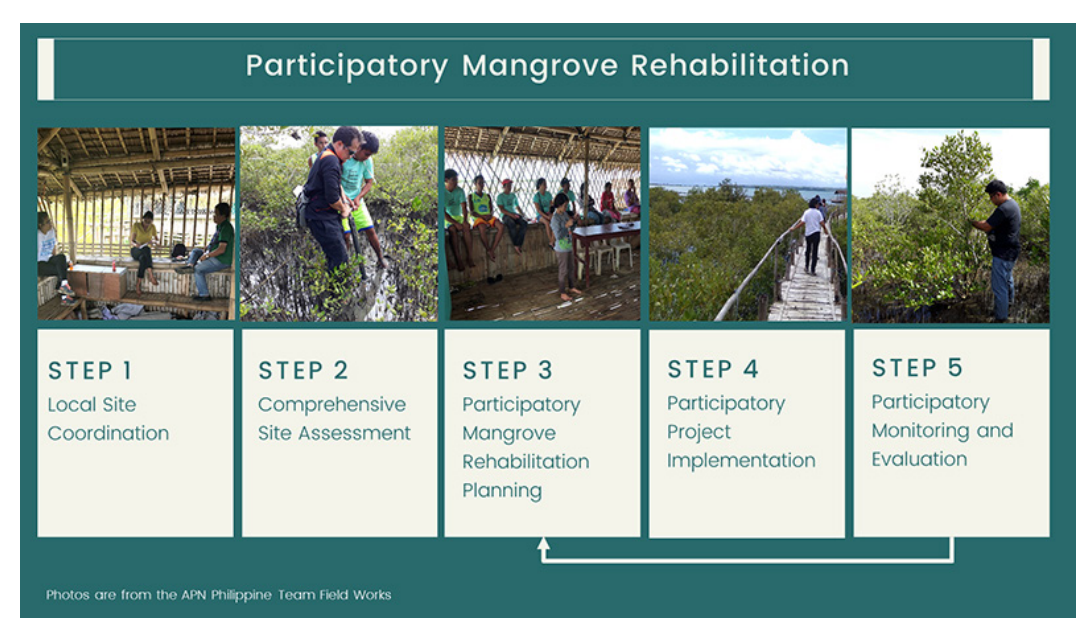
FIGURE 2. Participatory Mangrove Rehabilitation Framework.

use rights as well as management responsibilities was the key factor driving successful mangrove restoration in the Philippines and Myanmar. Furthermore, local income from non-timber forest products (in India), ecotourism (in Japan), and shrimp farming (in China) are guaranteed if healthy mangrove forests are wellkept. In all countries, the feedbacks between mangrove restoration, other land uses and non-land economic activities were considered crucial for conserving biodiversity, mitigating climate change, increasing resilience to climate change, and sustainable socioeconomic development. Poor survival rates of planted mangroves were observed to be the result of: 1) poor planning; 2) limited understanding of the site's ecology; 3) poor programme management/governance/policy concerns; 4) tenure insecurity; 5) occurrence of natural disasters; 6) poor monitoring; and (7) lack of timely corrective measures (Table 1).