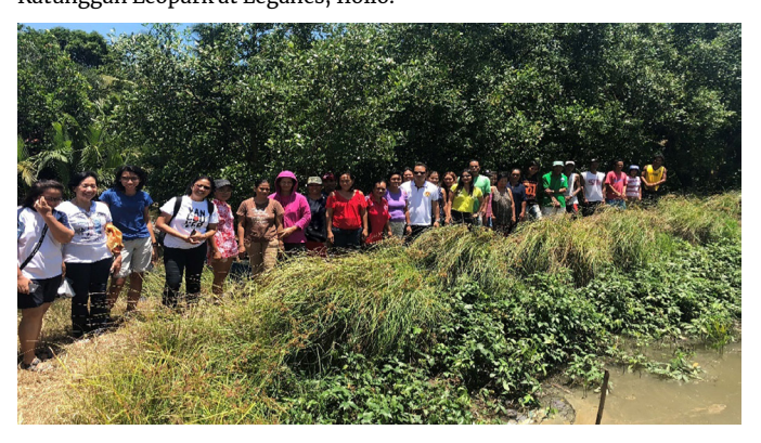
FIGURE 4. The Philippine Research Team with stakeholders at Barotac Nuevo, Iloilo.

local government unit (LGU) and a Non-Governmental Organization viz., the Zoological Society of London (ZSL); 2) Taklong Island Marine Reserve in Guimaras Province (Scheme: local community in partnership with the Department of Environment and Natural Resources, or DENR); and 3) Jalaud Mangrove Rehabilitation in Barotac Nuevo, Iloilo (Scheme: local community in partnership with the Iloilo State College of Fisheries).