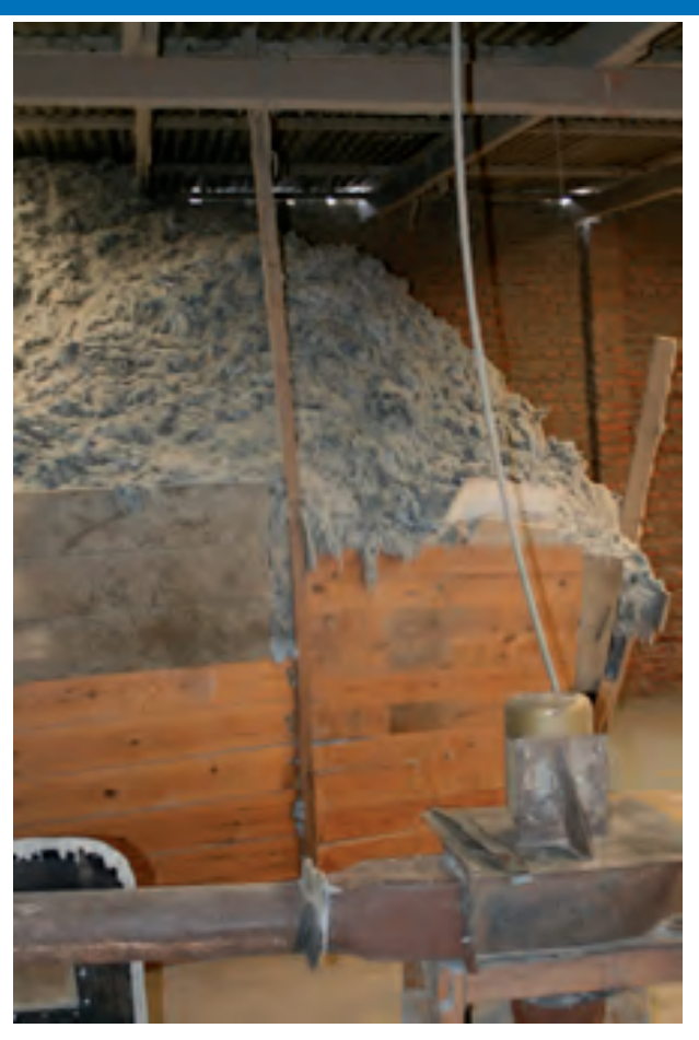
PHOTO OF THE STORAGE AREA SHOWING PILE OF CROCIDOLITE BEFORE BEING MILLED

from the installation and manipulation of crocidolite containing materials in sheds and courtyards; the use of soil admixtures for pavement hardening and enhanced water absorption; home thermal insulation [5,6] and maintenance [14]. It was also in diverse local commercial building materials [6,15] and contaminated river waste (Mirabelli, pers. commun. 2011) so it was not surprising to find that construction workers were also found to be at risk [16]. Five years after the Casale plant closed, 50% of the fibres in air samples from the town still contained long fibre crocidolite and the incidence of mesothelioma remains, to this day, grossly elevated [7, 8].