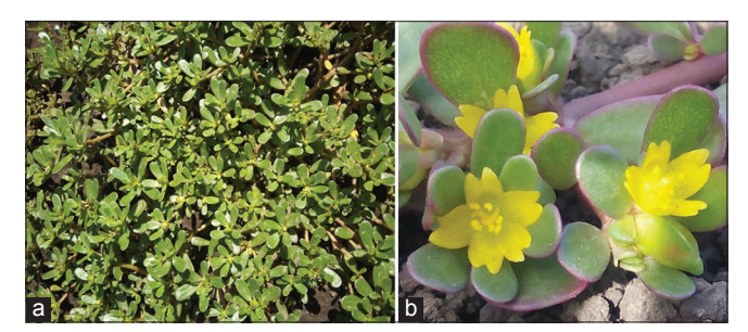
Fig. 1: (a and b) Portulaca oleracea

The methanolic extracts of different parts of the plants were performed on gas chromatograph "Agilent 7890B" with mass spectrometer detector 5977B. The capillary column was DB-5 ms 30 m in length, 250 \mu m inner diameter, and 0.25 \mu m film thickness. Helium was used as carrier gas at a constant flow rate of 1.3 ml/min with an injection volume of 0.5 \mu l with an injector temperature of 265°C. The oven temperature was programmed from an initial temperature of 70°C (isothermal for 1 min), with an increase of 20°C/min to 150°C (isothermal for 1 min), and with an increase of 20°C/min to 270°C (isothermal for 4 min). The compounds were identified and authenticated using their MS data by compassion with those of the NIST14 mass spectral library.