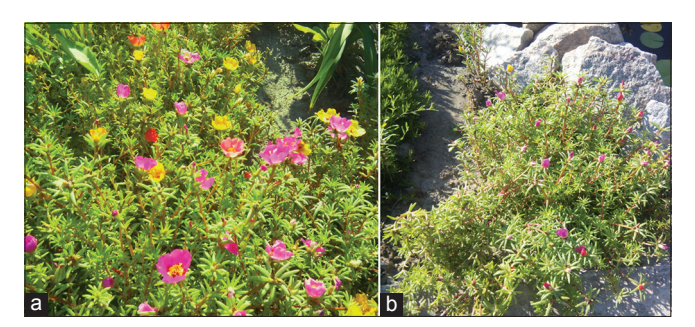
Fig. 2: (a and b) Portulaca grandiflora

The chemicals methanol, ascorbic acid, and DPPH were purchased from Sigma-Aldrich, USA [10].