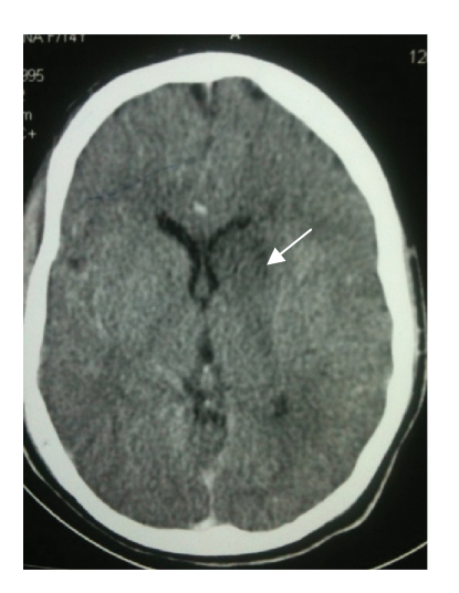
Figure 3 Left internal capsule infarct.