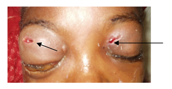
Figure I Photograph of patient following orbitotomies. Note bilateral exophthalmia, bilateral chemosis and bilateral eyelid oedema. The two arrows are pointing at the two orbitotomies.

Ophthalmic consultation was sought 4 days later. It revealed fistulization to the left upper eyelid. Needle aspiration