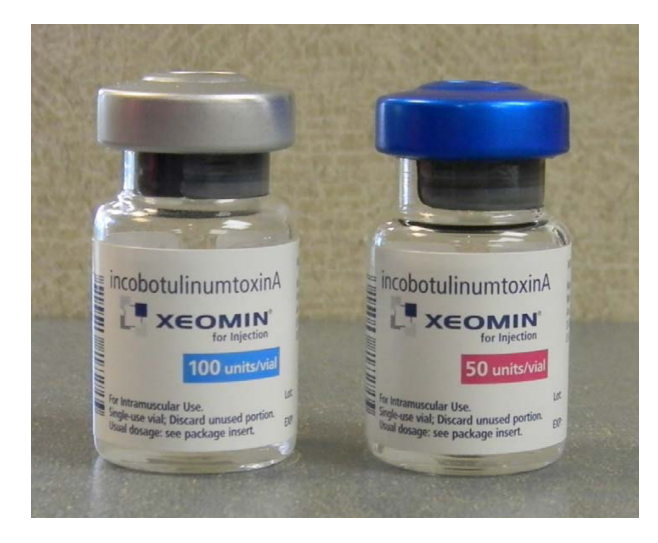
Figure I Recently US FDA approved botulinum toxin type A, Xeomin<sup>®</sup> (incobotulinumtoxinA).

In August, 2010 the US Food and Drug Administration (FDA) approved Xeomin<sup>®</sup> (incobotulinumtoxinA<sup>10</sup>; Merz Pharmaceuticals GmbH, Frankfurt, Germany) for the treatment of cervical dystonia or blepharospasm in adults (Figure 1). Now Xeomin<sup>®</sup> is the fourth BoNT product licensed for the US market, following Botox<sup>®</sup> (onabotulinumtoxinA;