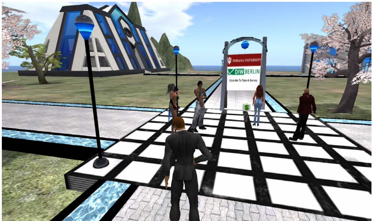
Figure 1. Survey Kiosk