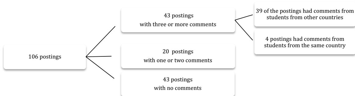
Table 3. Overview of the data corpus from group A

The dataset in Facebook group A consisted of 106 postings; 43 of these received no comments, but most of the postings had some ‘likes’, and 20 postings received one or two comments. Moreover, 43 postings received three or more comments, of which 39 included comments by students from more than one country (see Table 3).