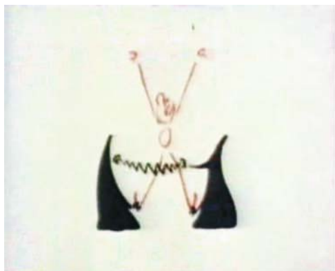
Figure 1. Rondino : “spot characters” torture a “line character.” Figure 2. The Fly : the title character ends up in a collection of insects.