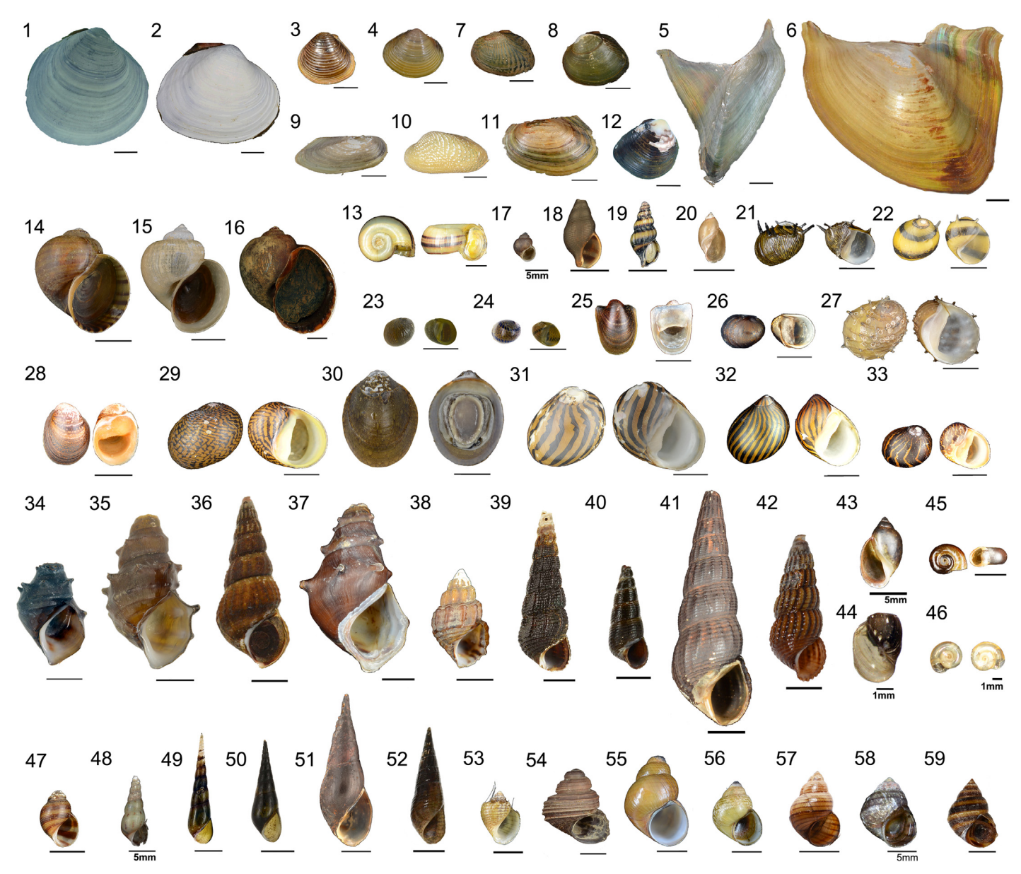
Fig 1. Freshwater molluscs in the ornamental pet trade. Unless indicated differently, scale bars = 10mm. 1. Batissa similis; 2. Batissa violacea; 3. Corbicula fluminea; 4. Corbicula moltkiana; 5. Hyriopsis bialata; 6. Hyriopsis desowitzi; 7. Parreysia burmana; 8. Parreysia tavoyensis; 9. Pilsbryoconcha exilis; 10. Scabies crispata; 11. Sinanodonta woodiana; 12. Unionetta fabagina; 13. Marisa cornuarietis; 14. Pomacea canaliculata; 15. Pomacea diffusa; 16. Pomacea maculata; 17. Bithynia sp.; 18. Clea bockii; 19. Clea helena; 20. Radix rubiginosa; 21. Clithon corona; 22. Clithon diadema; 23. Clithon lentiginosum; 24. Clithon mertoniana; 25. Neripteron auriculata; 26. Neritina iris; 27. Neritina juttingae; 28. Neritina violacea; 29. Neritodryas cornea; 30. Septaria porcellana; 31. Vittina coromandeliana; 32. Vittina turrita; 33. Vittina waigiensis; 34. Brotia armata; 35. Brotia binodosa; 36. Brotia herculea; 37. Brotia pagodula; 38. Sulcospira tonkiniana; 39. Tylomelania towutica; 40. Tylomelania sp.; 41. Tylomelania sp.; 42. Tylomelania sp.; 43. Physa sp.; 44. Amerianna carinata; 45. Indoplanorbis exustus; 46. Gyraulus convexiusculus; 47. Semisulcospira sp.; 48. Melanoides tuberculata; 49. Stenomelania offachiensis; 50. Stenomelania plicaria; 51. Stenomelania cf. plicaria; 52. Stenomelania sp.; 53. Thiara cancellata; 54. Celetaia persculpta; 55. Filopaludina cambodjensis; 56. Filopaludina peninsularis; 57. Filopaludina polygramma; 58. Sinotaia guangdungensis; 59. Taia pseudoshanensis.