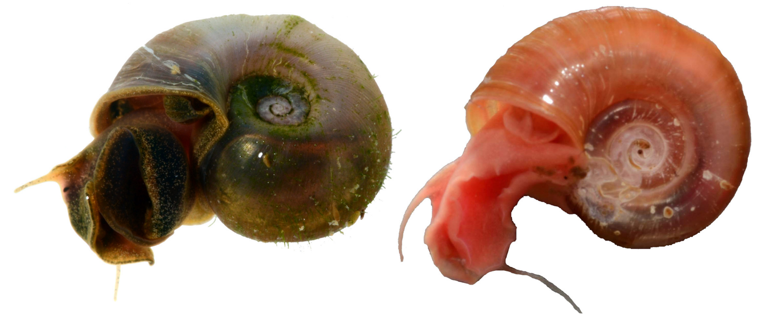
Fig 3. Two morphs of Indoplanorbis exustus in the aquarium trade.

DNA barcodes work well when the chosen molecular markers are sufficiently diagnostic to delimit species [111] and the species taxonomy of species is well resolved [111]; most species in our study satisfied these conditions. Some exceptions, however, were closely-related, sympatric species ( Tylomelania spp., Brotia armata, Brotia binodosa ) that failed to have diagnostic barcodes, possibly due to either recent speciation or to introgression [63]. Our study also included species with poorly understood species boundaries; a good example is in the case of three Stenomelania spp. in the trade which belong to the Stenomelania plicaria species complex ([112], M. Glaubrecht pers. comm.). DNA barcodes can here suggest species boundaries, but they