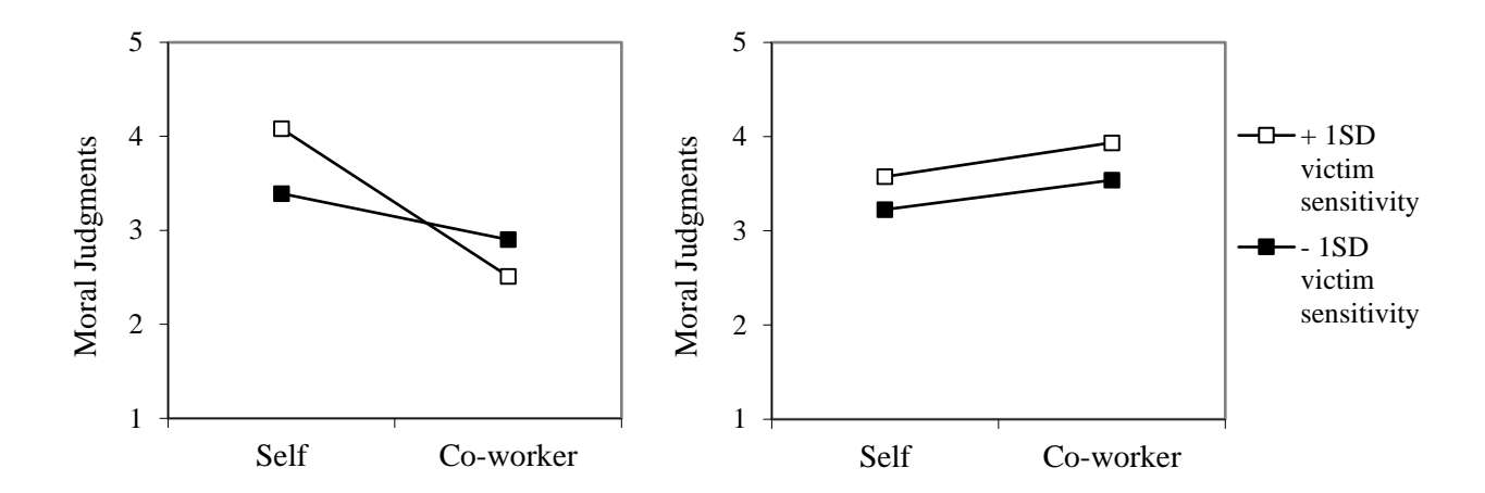
Figure 3. Moral judgments as a function of target condition and victim sensitivity in the distrust (left panel) and trust (right panel) conditions (Study 4). Participants' mean moral judgments of the imagined moral transgressions either committed by themselves or committed by their co-worker at \pm 1 standard deviation of victim sensitivity in the distrust (left panel) and trust (right panel) conditions. Higher values indicate more lenient moral judgments (scale 1-9).

victim-sensitive participants, that is, individuals who are highly motivated to avoid exploitation. In contrast, when trusting another person, victim sensitivity did not predict moral hypocrisy. In line with our reasoning, these findings suggest that people may utilize hypocritical moral judgments to counteract the threat of exploitation when perceiving the need to protect themselves under conditions of distrust.