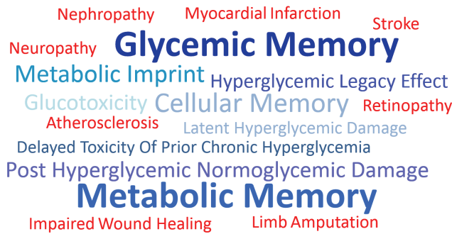
FIGURE 1: Word cloud illustrating diverse nomenclature for glycemic memory and associated diabetic complications.

term which refers to the delayed adverse effects triggered by prior exposure to glucotoxicity, lipotoxicity, and other metabolic imbalances. Because hyperglycemia is considered a key mechanistic driver for diabetic vascular complications and most in vitro experimental models have been based solely on high glucose exposure, here we endorse the term glycemic memory. However, metabolic memory is often used as an interchangeable term to describe this phenomenon, because it has been proposed that more than just tight glucose control is needed to prevent diabetic complications [13]. This review summarizes past and recent research on the role of glycemic memory in the prognosis of diabetic micro and macro vascular complications, covering from experimental in vitro models to human clinical trials. In addition, it discusses the relevance of epigenetics, with particular focus on how this might impact on endothelial progenitors as one of the cellular substrates of glycemic memory.